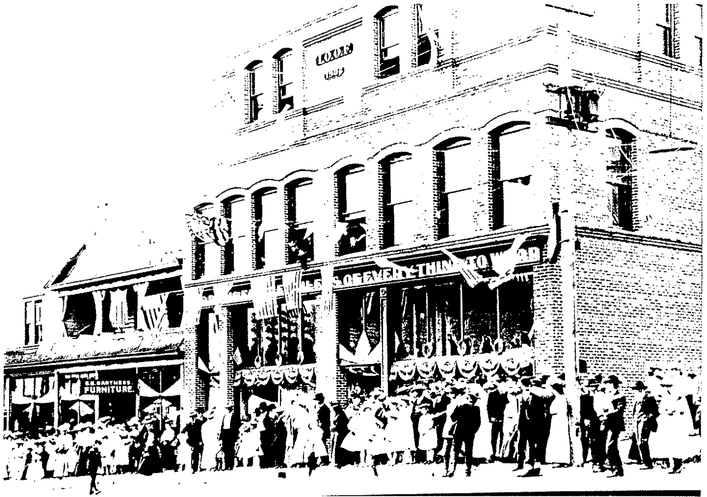
The I.O.O.F. Hall/ Paris Fair Building, 4th and Oak Str., ca. 1900