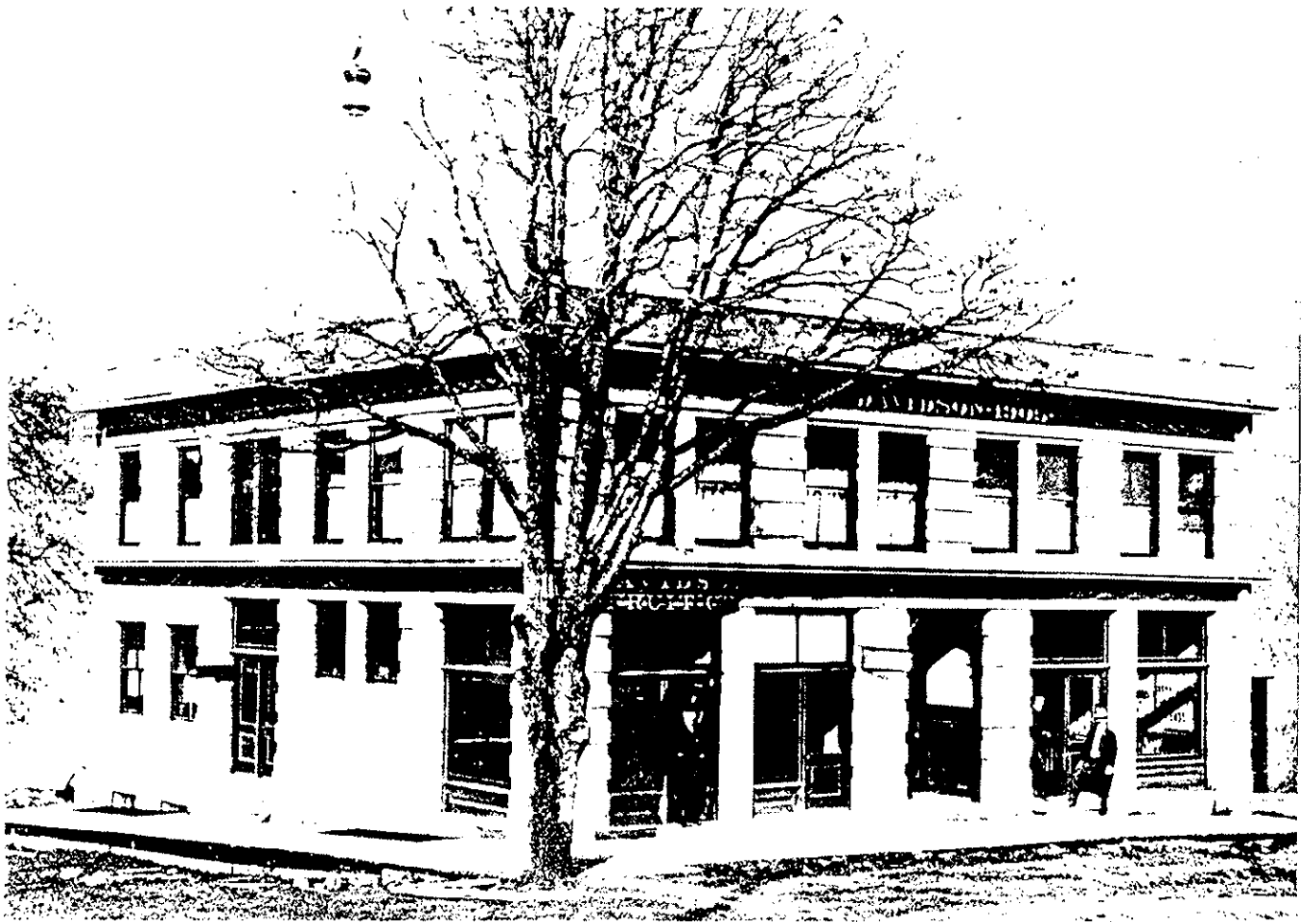
The Davidson Fruit Company Building, ca.1907