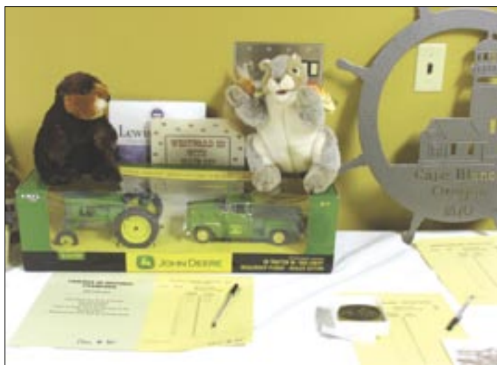
Silent Auction items on display during the 2007 Cooperative Association Conference.