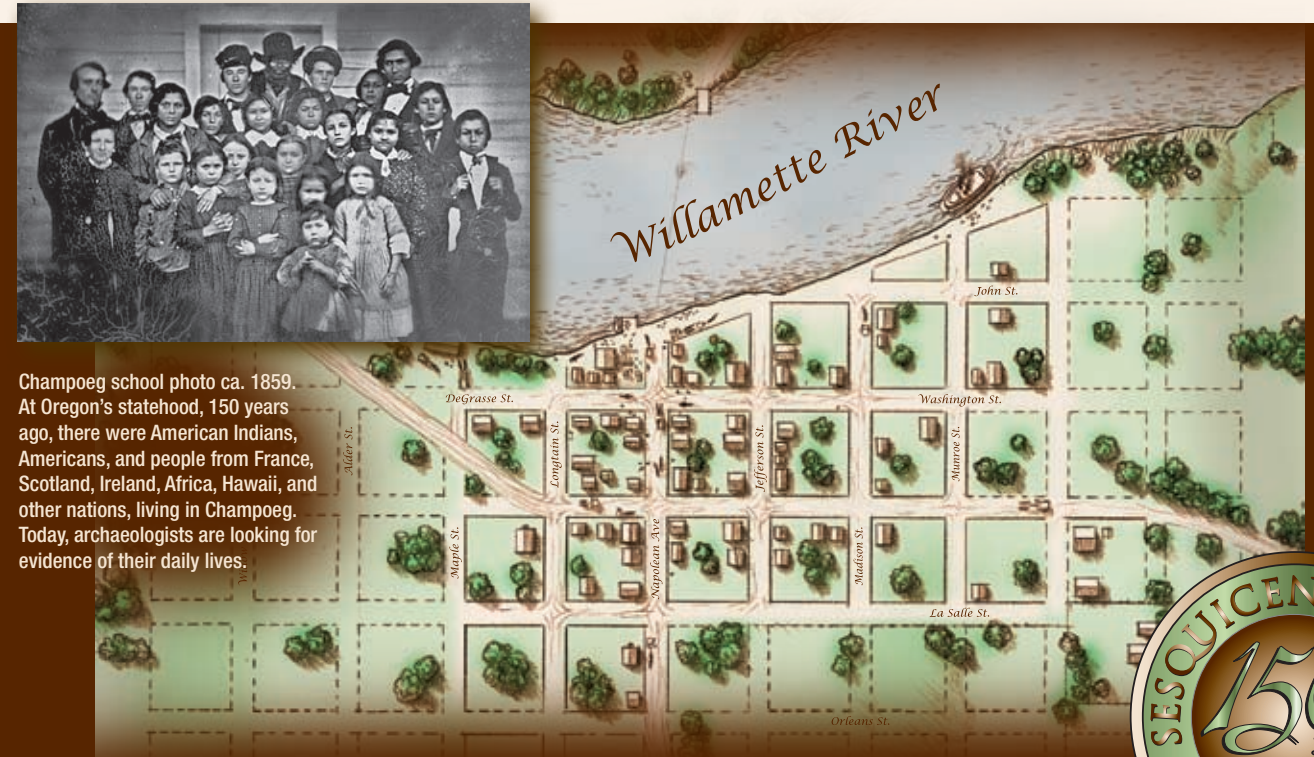
Champoeg school photo ca. 1859. At Oregon's statehood, 150 years ago, there were American Indians, Americans, and people from France, Scotland, Ireland, Africa, Hawaii, and other nations, living in Champoeg. Today, archaeologists are looking for evidence of their daily lives.

Kalapuya Indian families lived in the Champoeg area for generations prior to the first permanent homes of Hudson Bay Company families established in the 1830s. In its growing population, Champoeg saw many diverse cultures and people, including American Indians from many different tribes in the United States and Canada, people from France, Scotland, Ireland, Africa, Hawaii and from the eastern United States. On May 2, 1843, settlers in the Willamette Valley met at Champoeg's Hudson Bay Company granary and trade store and voted 52 to 50 to organize a provisional government, the first such government in the Pacific Northwest. From this initial decision at Champoeg, the people of Oregon made a choice to become part of the United States and, on February 14, 1859, Oregon joined the Union as the 33rd state. By the time of statehood, Champoeg had 50 buildings and a population of 200. The cultural diversity of Champoeg is evidenced in the naming of its streets and in the cultural material that archaeologists have found.