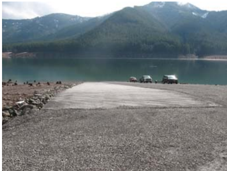
On the left is Detroit Lake in Marion County. The Low Water Ramp was completed this last fall/winter.