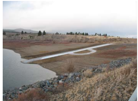
On the right is Wolf Creek Reservoir in Union County. A new ramp and boarding floats for this popular boating site.