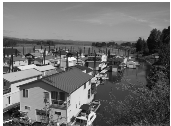
Big Eddy Marina