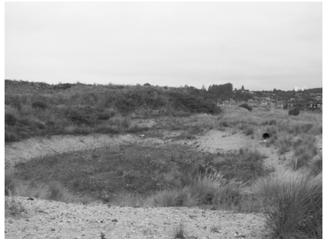
Port of Newport stormwater runoff infiltration catch basin.