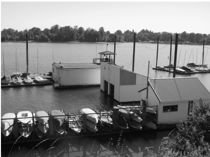
Willamette Sailing Club