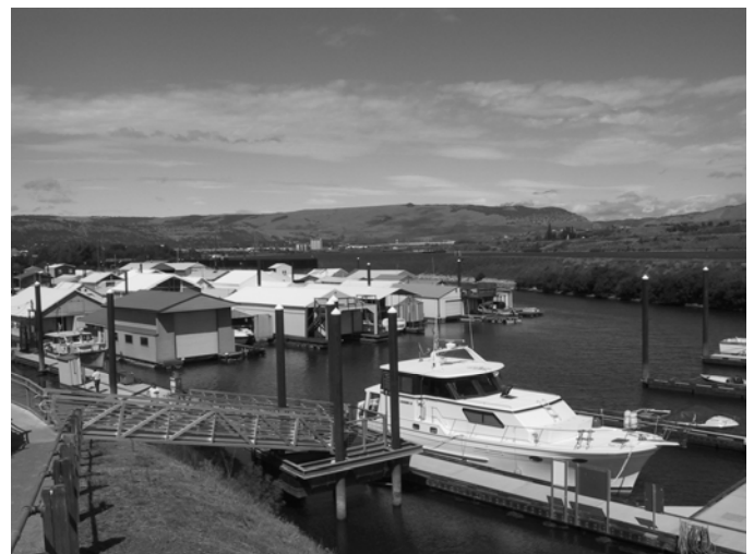
Port of The Dalles