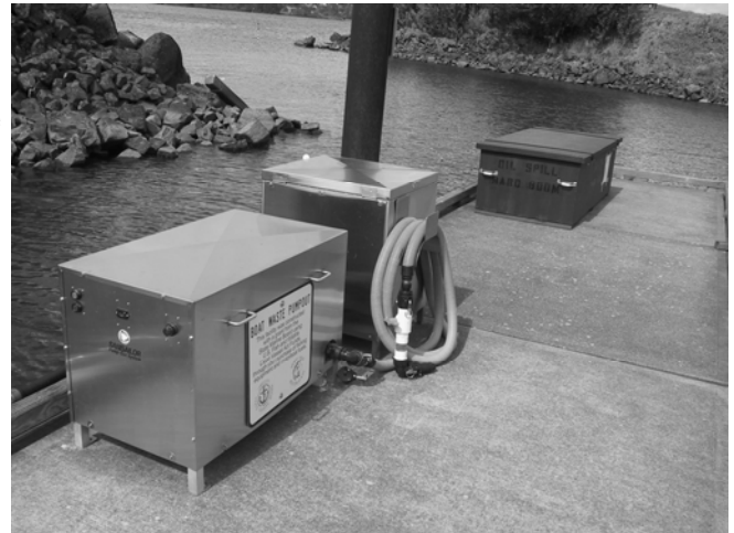
Newly replaced sewage pumpout and new oil spill response boom.

The Port of Cascade Locks with 37 boat slips is the next marina in the Columbia River Gorge to join the program. Over the years this facility has made many improvements with the help of the Oregon Marine Board's Facility Grant Program. The most recent improvement to the marina has been the upgrade and replacement of the boat sewage pumpout station, and this winter the boat ramp will be updated. In addition to these Marine Board funded projects the Port has also recently invested in some oil spill response equipment to help safeguard the Columbia River. The Port has also funded an aquatic weed management project. Treatment of Eurasian Watermilfoil took place this past spring, and as a result the plants ability to re-grow has been severely reduced. Hopefully with another treatment next year this invasive plant can be kept out of the marina waters. An overview of the other recently implemented projects at the marina include: