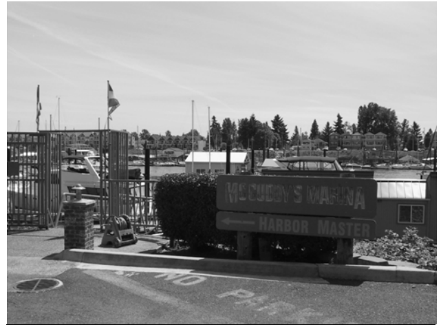
McCuddy's Island Marina