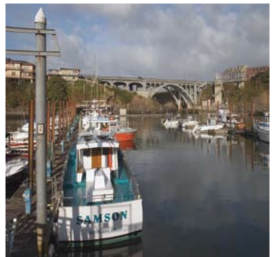
Depoe Bay bridge from the harbor side

Millions of years of the relentless pounding of ocean on rock have made Depoe Bay the world's smallest year-round navigable harbor. Unlike most other harbors in Oregon, the land-locked bay is not a river estuary. Its egress to the ocean is a 50- by 300-foot slit through steep basalt cliffs. Getting a boat through this notch is known locally as "shooting the hole." Even though there is no river current to complicate the tidal flux, boaters should be extremely cautious entering and exiting the harbor.