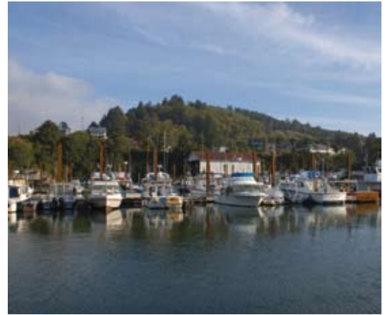
A protected cove