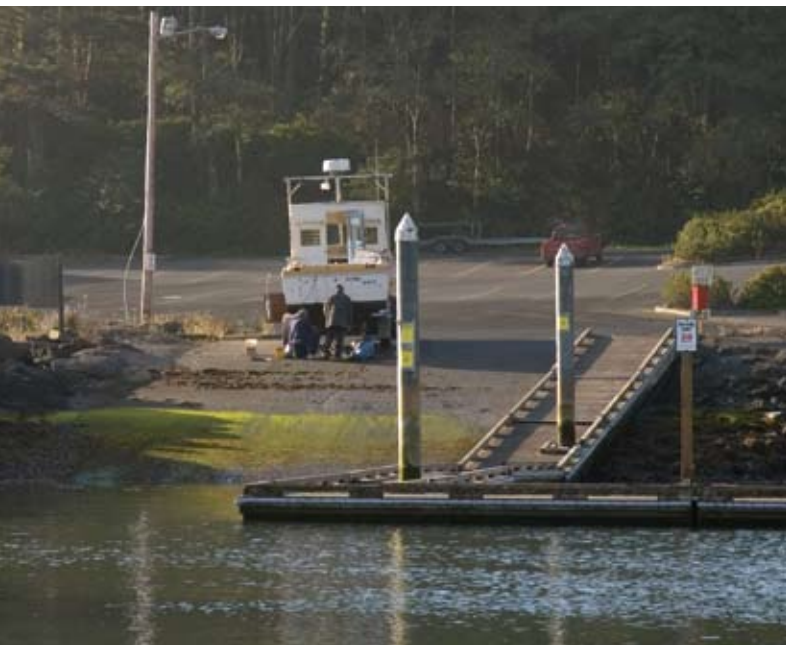
Working on the boat at Depoe Bay