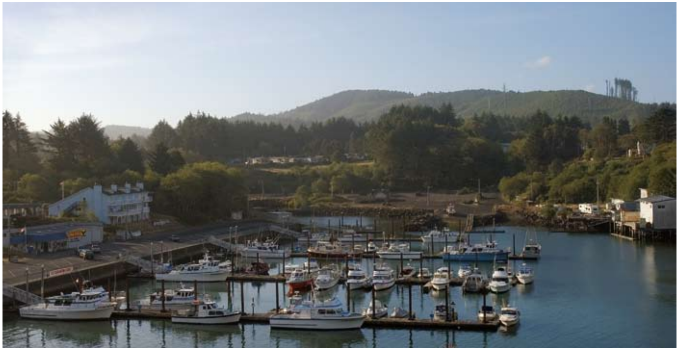
Gull's-eye view of the diminutive Depoe Bay boat basin