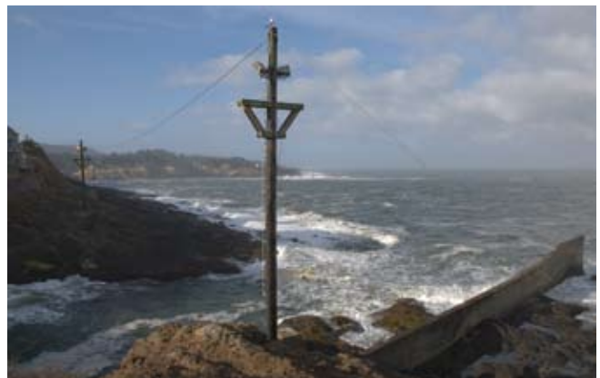
Looking out to sea from the north jetty

About a mile and a half north along Highway 101 is Boiler Bay State Scenic Viewpoint. It is named for a boiler from a wrecked ship that washed up in the cove in 1910. Tidepools are exposed at low tide, and the park is a good place to watch whales and seabirds.