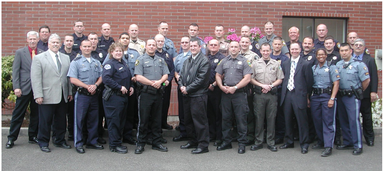
Oregon DRE Class #15 May 2007 Monmouth, OR

The certification phase was held in Portland, Oregon. This year Oregon hosted 12 students from Idaho. During the certification phase, 245 DRE evaluations were completed in 8 days to certify the 26 students from Oregon as well as 12 students from Idaho. Also during this time 11 new DRE Instructors were certified.