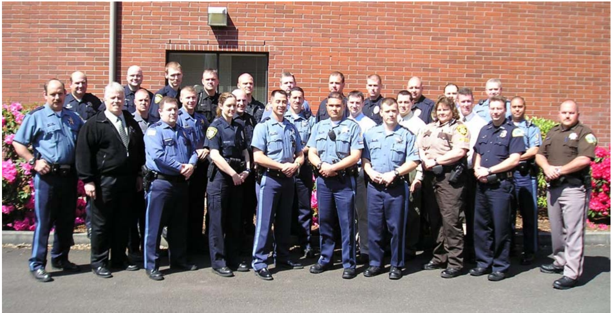
Oregon DRE Class #13 May 2005 Monmouth, OR

During 2005, Oregon conducted one DRE school, training a total of 22 officers as Drug Recognition Experts (DREs). The school was held in May at the Oregon Military Academy in Monmouth. The training included five troopers from the Oregon State Police, thirteen officers from city police departments, and four sheriff's deputies. All 22 officers successfully completed the school and then completed the certification phase held in Portland, Oregon. During the certification phase, 131 DRE evaluations were completed.