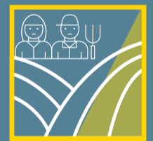
Undeveloped land is protected for farming