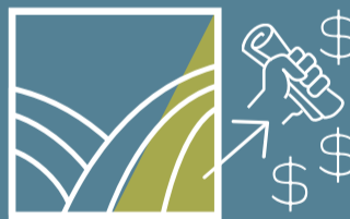
Easement protects land, offers financial benefits