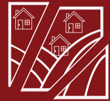
Eventually, land is developed