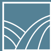
Farmer chooses easement