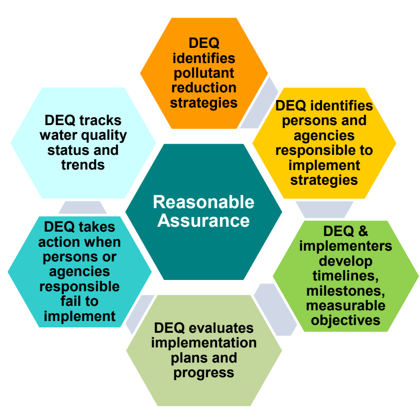
Figure 7.1 Representation of the Reasonable Assurance Accountability Framework Led by DEQ

Reasonable assurance that needed load reductions will be achieved for nonpoint sources is based primarily on an accountability framework incorporated into the WQMP, together with the implementation plans of persons responsible for implementation. This approach is similar to the accountability framework adopted by EPA for the Chesapeake Bay TMDL, which was adopted in 2010. Figure 7.1 presents the accountability framework elements, which are intended to work in concert to demonstrate reasonable assurance of implementation.