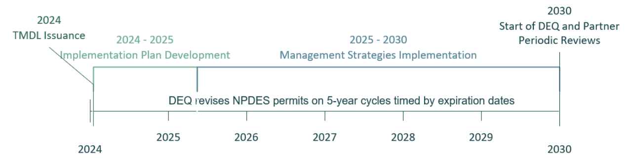
Figure 3.0: Lower Columbia-Sandy Subbasin TMDL implementation timeline

OAR 340-042-0040(I)(D) requires a WQMP address schedules for implementing management strategies including permit revisions, achieving appropriate incremental and measurable water quality targets, implementing control actions and completing measurable milestones. DEQ's water quality permitting program has responsibility for revising permits to comply with TMDLs. Timelines for implementation of management strategies by responsible persons are discussed separately. Figure 3.0 presents a typified timeline for TMDL implementation in a five-year increment.