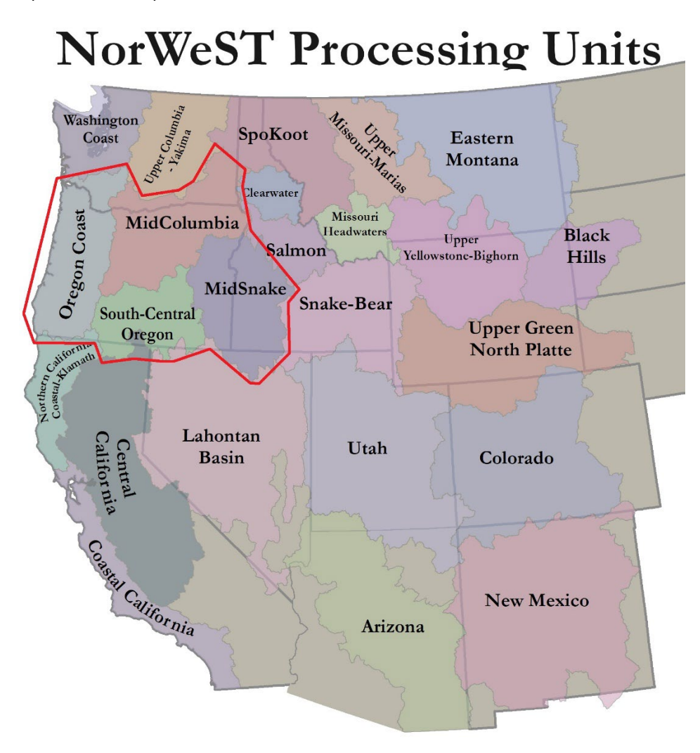
Figure 1: Map of NorWeST model area with Oregon-relevant PUs highlighted. Figure adapted from NorWeST model website (https://www.fs.fed.us/rm/boise/AWAE/projects/NorWeST.html).

Historic air temperature trends in the region were also presented by Isaak et al. (2017). Specifically, historic August air temperatures were developed as an input parameter into the NorWeST stream temperature model. The NorWeST model divides the western U.S. into 23 different geographic processing units (PUs) in its trend reconstruction analysis. These PUs were delineated based on physiographic similarity, expected data density, and National Hydrography Dataset (NHD) unit boundaries. The Oregon stream network lies within four of the 23 PUs (see Figure 1). For this literature synthesis, we reported only the trends for those four PUs, noting that those trends are not based exclusively on Oregon stream segments data (i.e., these four PUs include data from streams in neighboring states). This study reported that August mean air temperature trends in the Oregon-related PUs range from +0.29 to +0.53°C per decade between 1976-2015 (see Table 1).