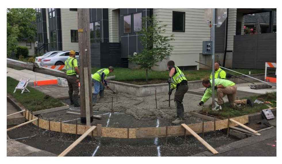
Workers at one of the Portland test sites moving wet, low carbon concrete.

With that in mind, the DEQ is working with cities and industry leaders to cut greenhouse gas emissions by using low carbon concrete. A recent pilot project in Portland showed that by using alternative concrete mixes, the carbon footprint of an average sidewalk ramp was reduced by 23-34 percent without increased cost or loss of structural integrity. Low carbon concrete uses less cement, which would be reflected as a lower Global Warming Potential value in a product declaration, which is akin to a nutritional label. By selecting the lowest cement