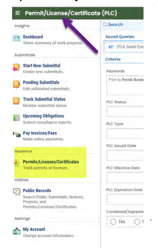
Step 1: Access your YDO account, and open the Permits/Licenses/Certificates module.

This will display the list of your certificate(s); see screenshot below. You can change the sort order in the drop-down box in the upper right: