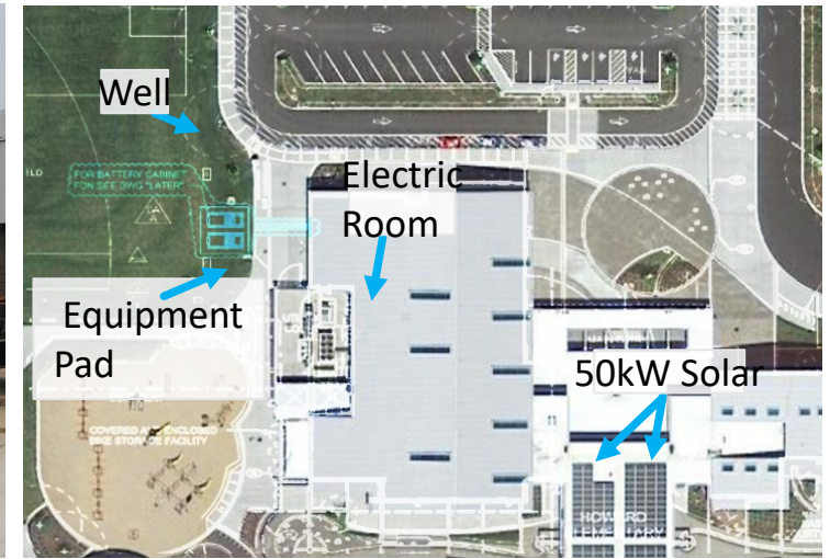
Grid Edge Demonstration Project in Eugene