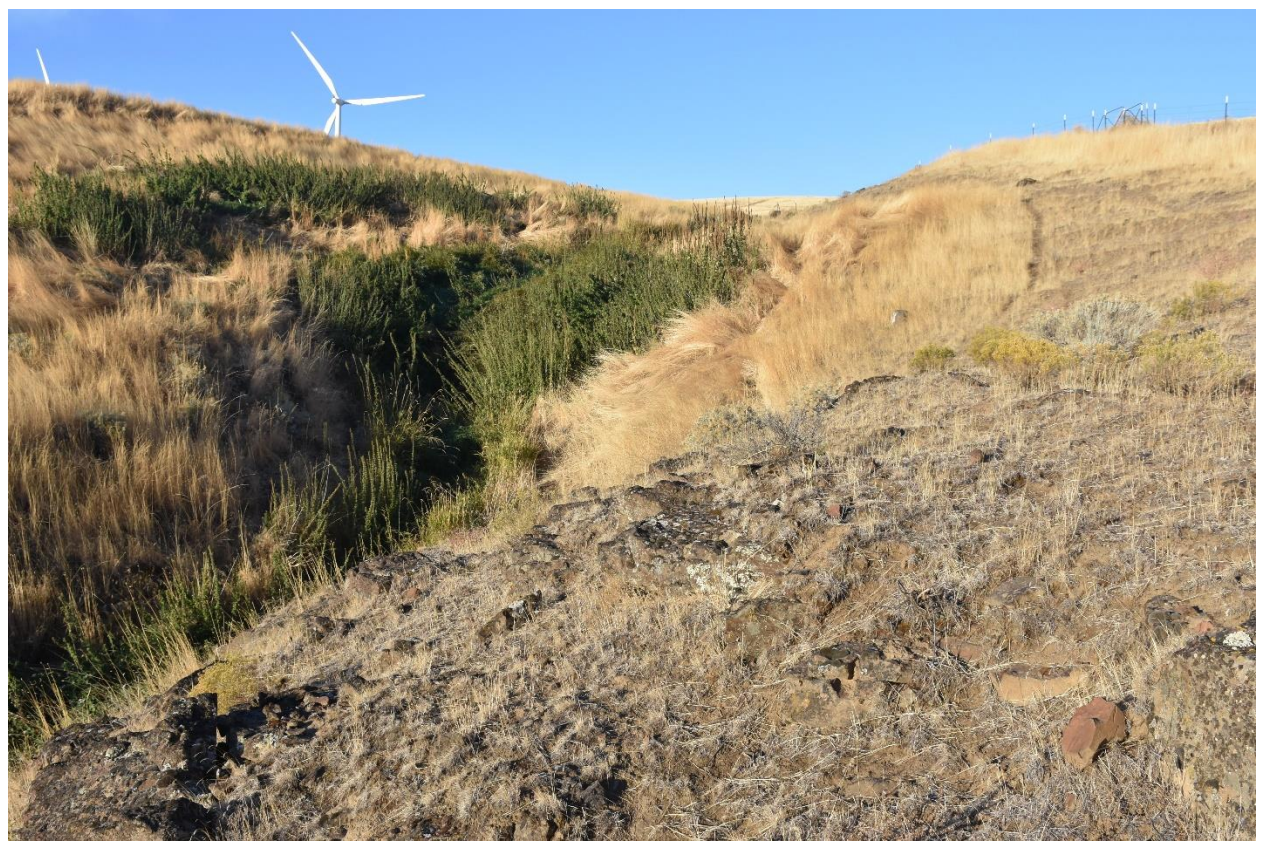
Figure 2. Photopoint #2 showing vegetation at the spring site, October 2022.