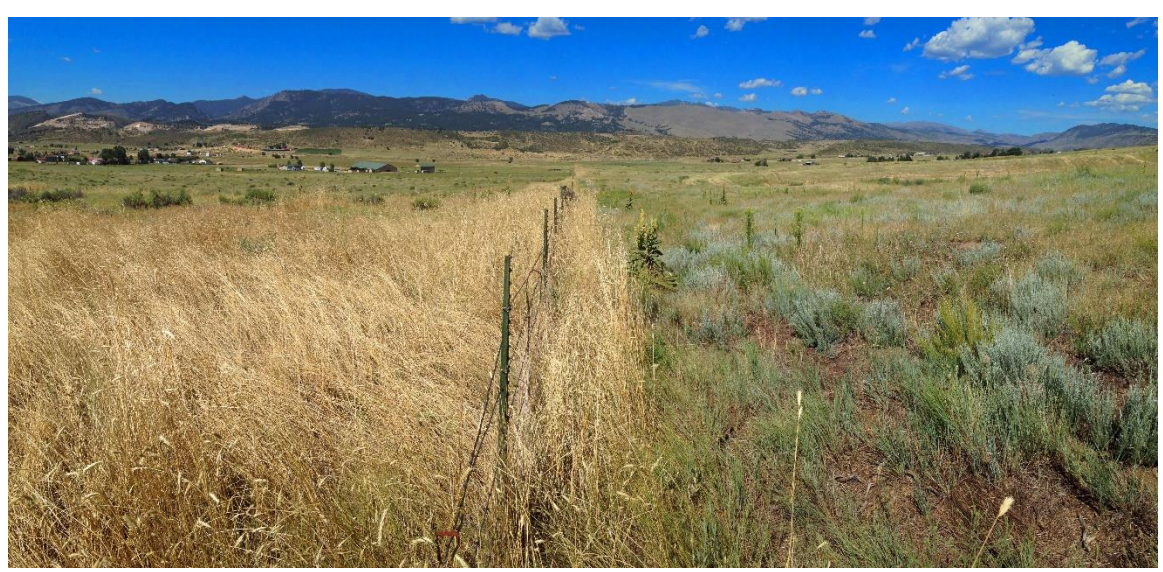
Figure 1. Photo showing cereal rye response to indaziflam (right) compared to control area (left) at Indian Creek, CO (DJ Sebastian, Bayer Environmental Science, personal communication).

<sup>1</sup>Double rate for broadcast seeding.