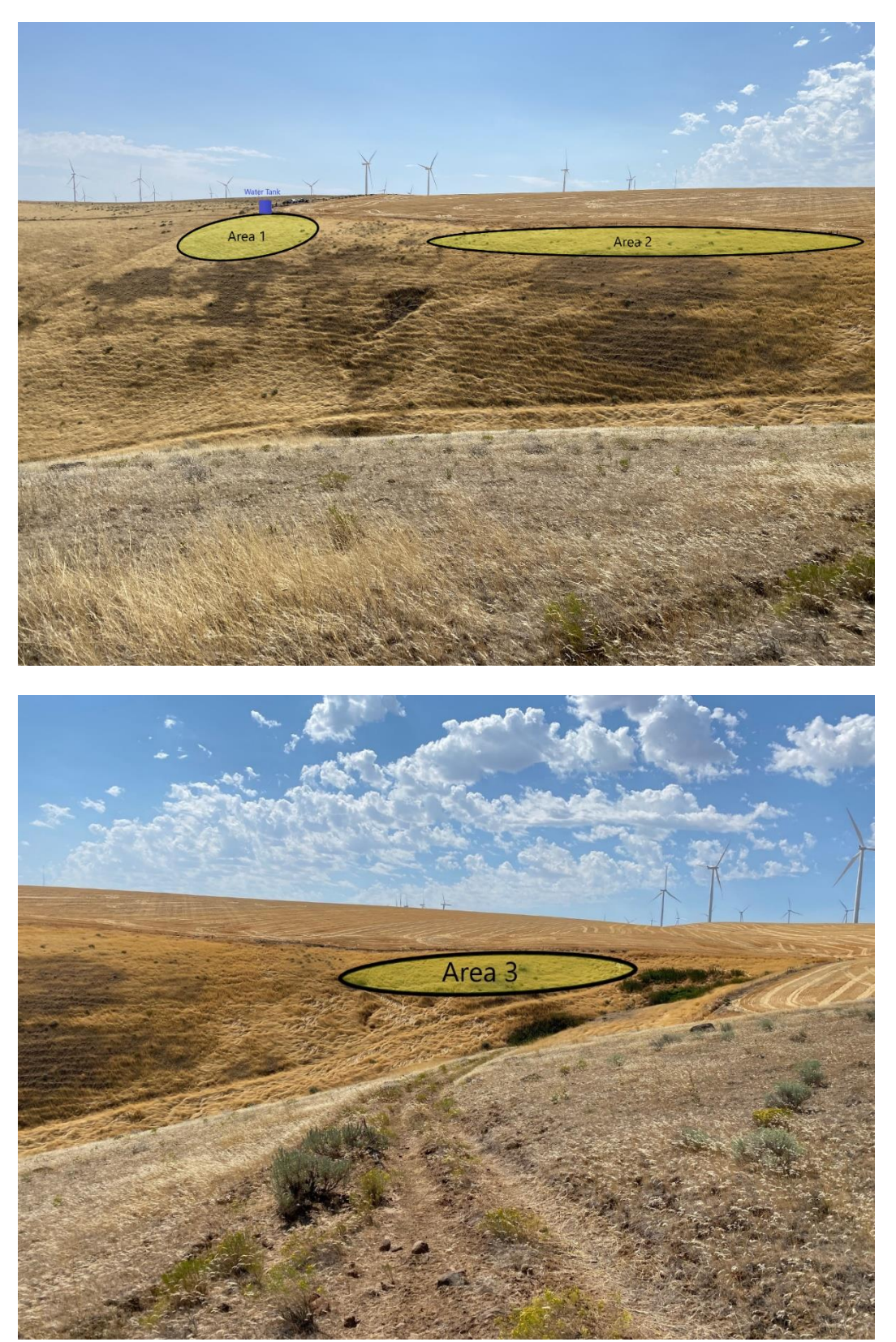
Figure 1. Area adjacent to spring site showing location of water tank (blue) and three proposed planting areas.