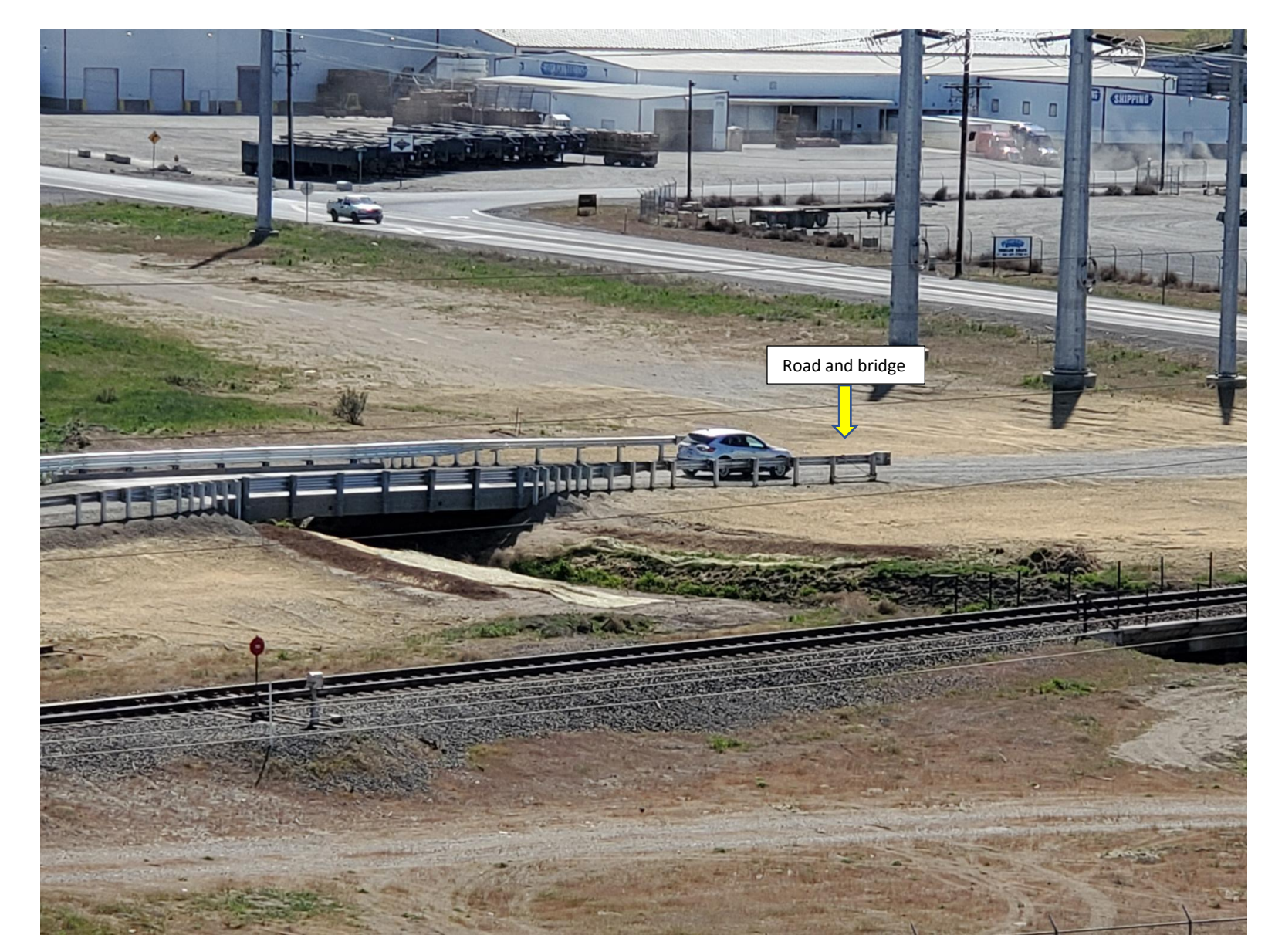
Figure 3: Perennial Wind Chaser Station – Road and Bridge (Current Conditions)

Final Order on Final Retirement Plan and Termination of the Perennial Wind Chaser Station Site Certificate September 2022