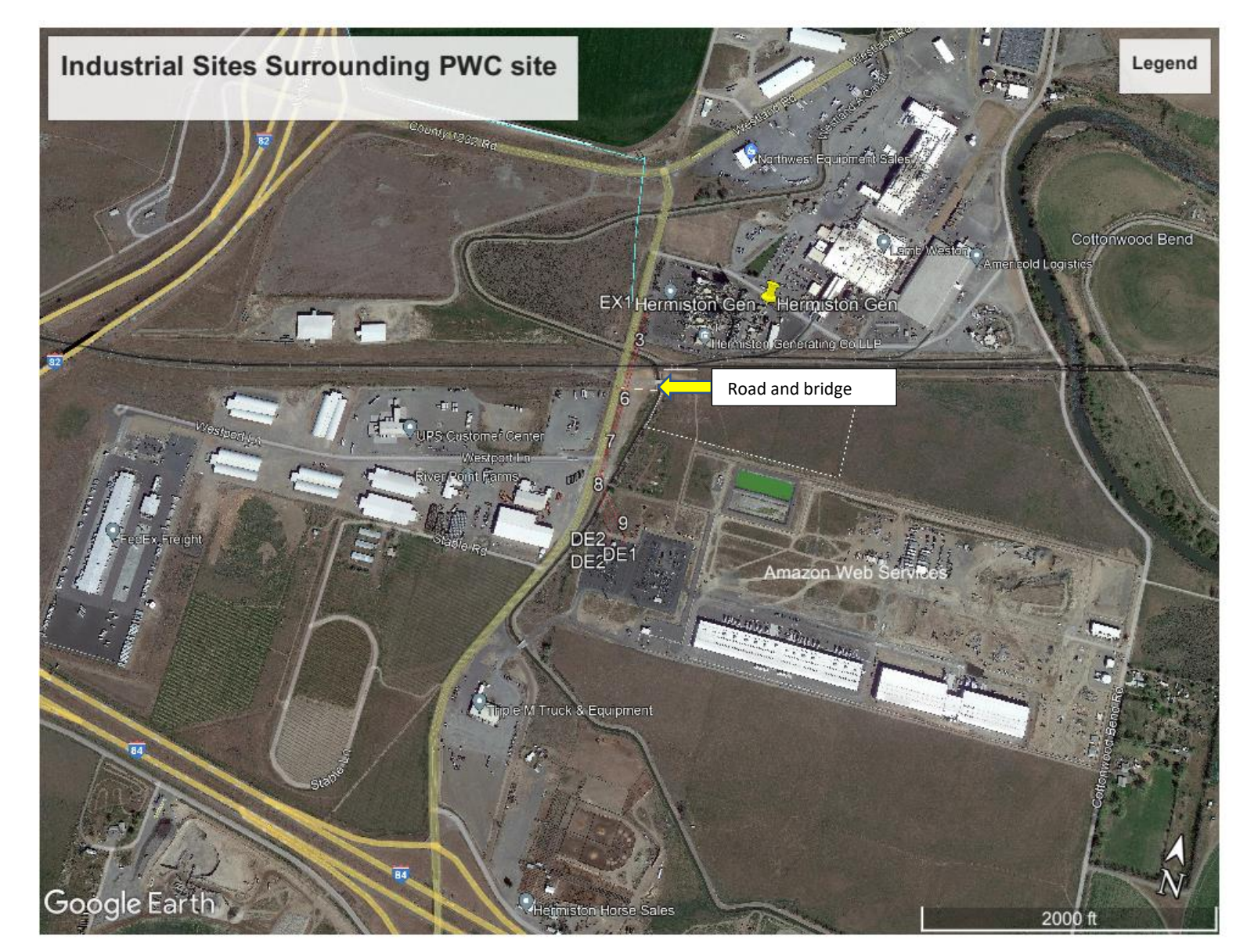
Figure 2: Perennial Wind Chaser Station Site Boundary and Call-out of Road and Bridge Location

Final Order on Final Retirement Plan and Termination of the Perennial Wind Chaser Station Site Certificate September 2022