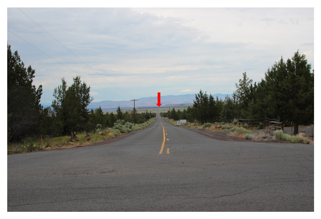
Photograph T-3 – From Photo Survey Point T-3 on Figure T-2: View from the intersection of SW Belmont Lane and SW Elk Drive along the route of the Madras Mountain Views Scenic Byway heading due north toward the Facility site boundary. (The red arrow indicates the approximate location of the Facility site about 2.5 miles north of Photo Survey Point T-3.)