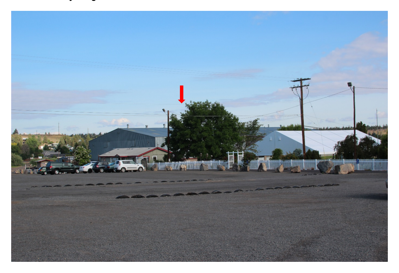
Photograph T-7 – From Photo Survey Point T-7 on Figure T-2 : View from the parking lot at the entrance of the Jefferson County Fairgrounds heading approximately 310° northwest toward the Facility site boundary. (The red arrow indicates the approximate location of the Facility site about 4.6 miles northwest of Photo Survey Point T-7.)