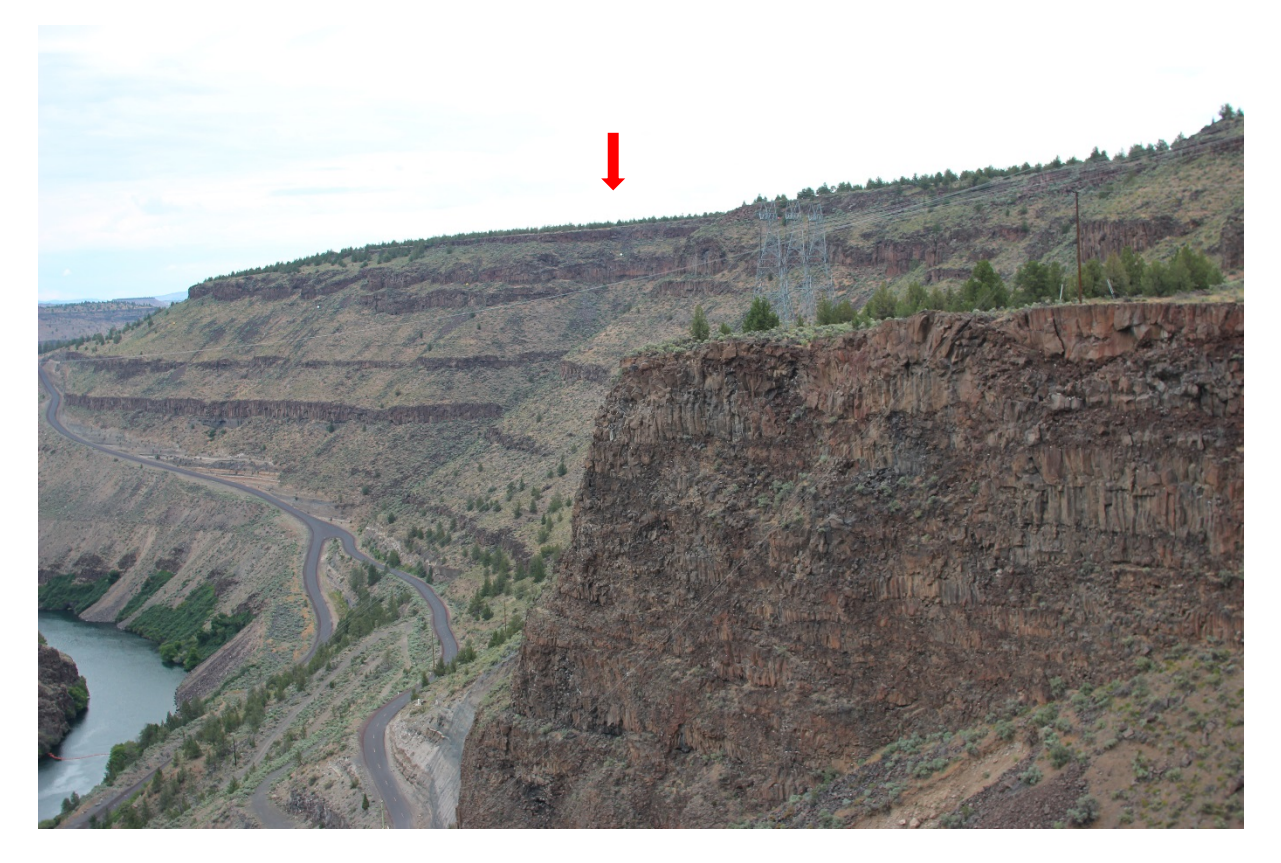
Photograph T-5 – From Photo Survey Point T-5 on Figure T-2: View from the platform at the Round Butte Overlook Park Interpretive Center heading approximately 25° NE toward the Facility site boundary. (The red arrow indicates the approximate location of the Facility site about 4.4 miles northeast of Photo Survey Point T-5.)