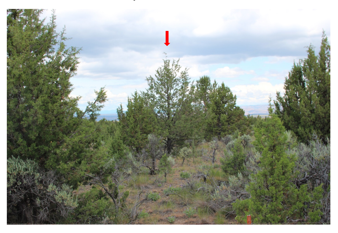
Photograph T-2 – From Photo Survey Point T-2 on Figure T-2: View from the westbound shoulder of SW Belmont Lane along the route of the Madras Mountain Views Scenic Byway heading approximately 355°N toward the Facility site boundary. (The red arrow indicates the approximate location of the Facility site about 2.5 miles north of Photo Survey Point T-2.)