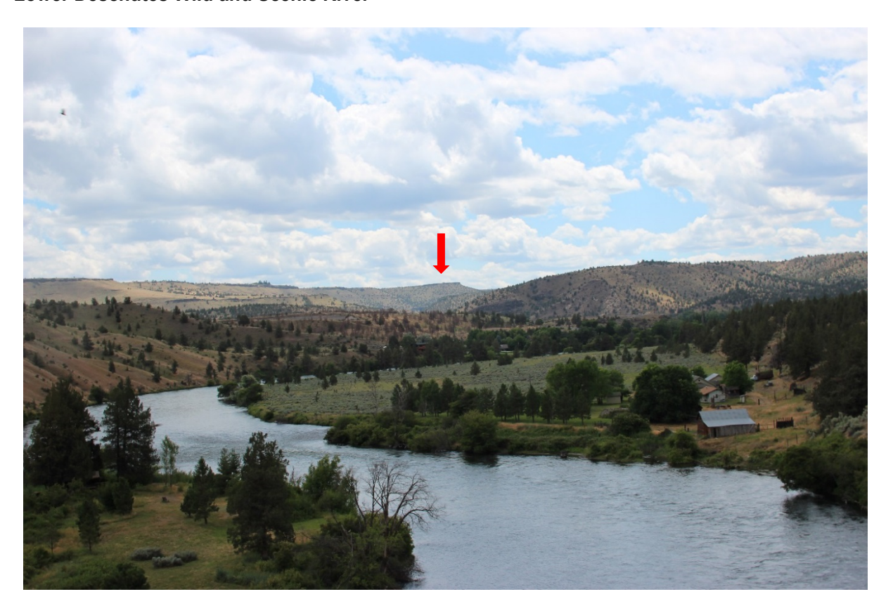
Photograph T-6 – From Photo Survey Point T-6 on Figure T-2: View from the northbound shoulder of Bureau of Indian Affairs (BIA) Road 24 within the mapped boundary of the Lower Deschutes Wild and Scenic River (north of the Pelton Dam and downstream of the County line) heading approximately 170°S toward the Facility site boundary. (The red arrow indicates the approximate location of the Facility site about 5 miles south of Photo Survey Point T-6.)