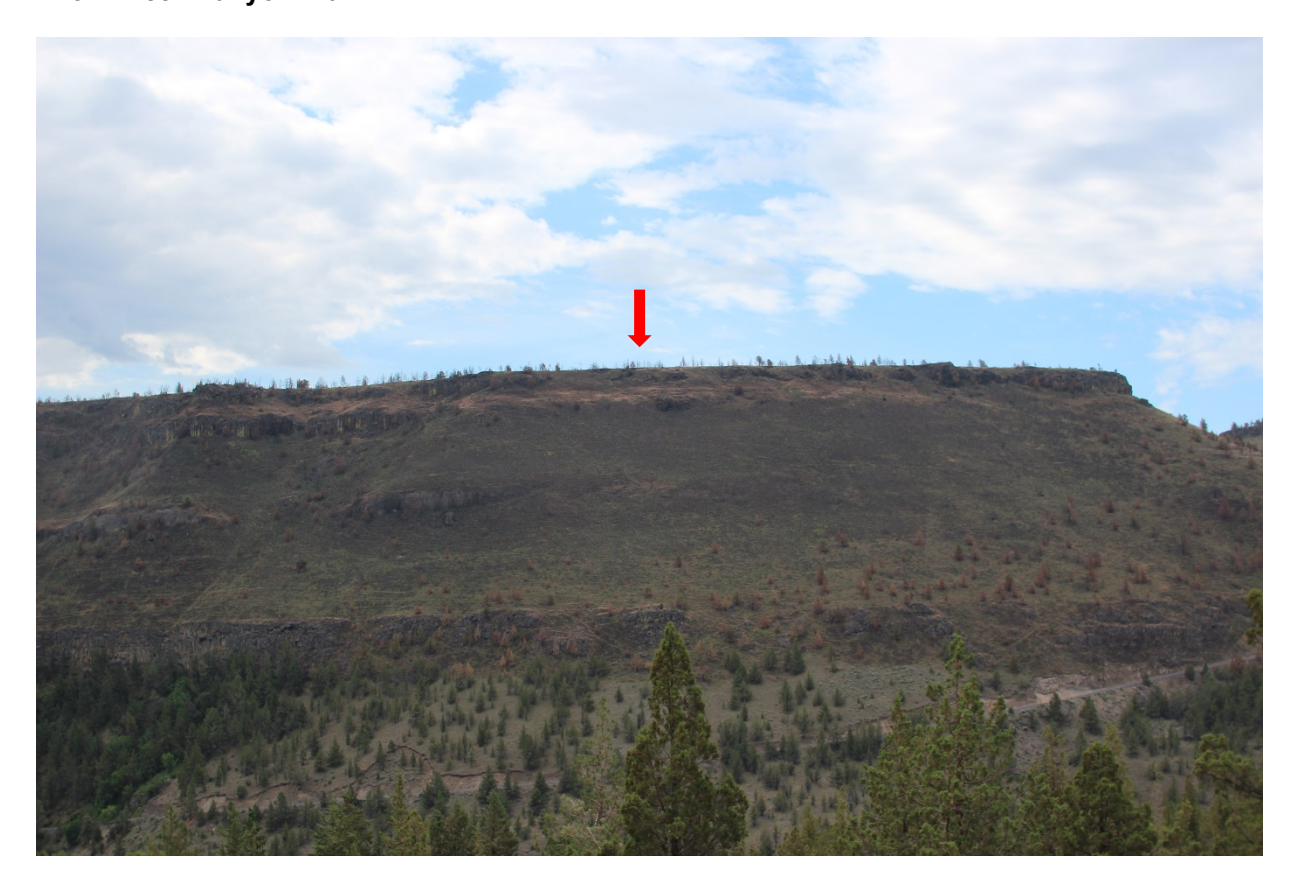
Photograph T-1a – From Photo Survey Point T-1 on Figure T-2 : View from a point on Willow Creek Road (which also serves as Willow Creek Canyon Trail) east of the intersection with NW Pelton Dam Road heading approximately 170°S toward the Facility site boundary. (The red arrow indicates the approximate location of the Facility site about 0.7 mile south of Photo Survey Point T-1.)