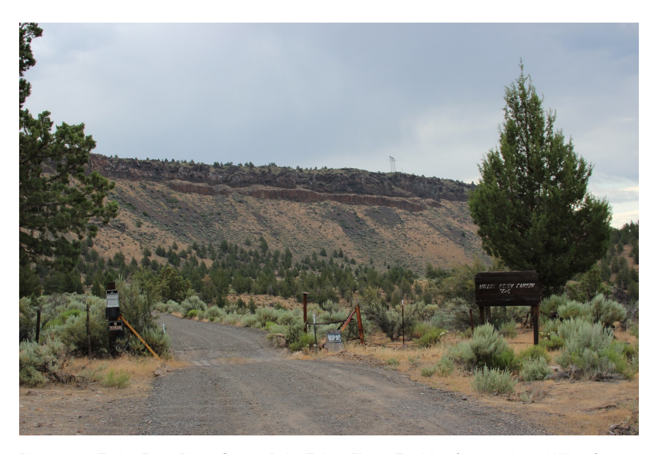
Photograph T-2b – From Photo Survey Point T-1 on Figure T-2: View from a point on Willow Creek Road (which also serves as Willow Creek Canyon Trail) east of the intersection with NW Pelton Dam Road heading approximately 90°E toward the City of Madras. (The Facility site is not in the viewshed of this photograph.)