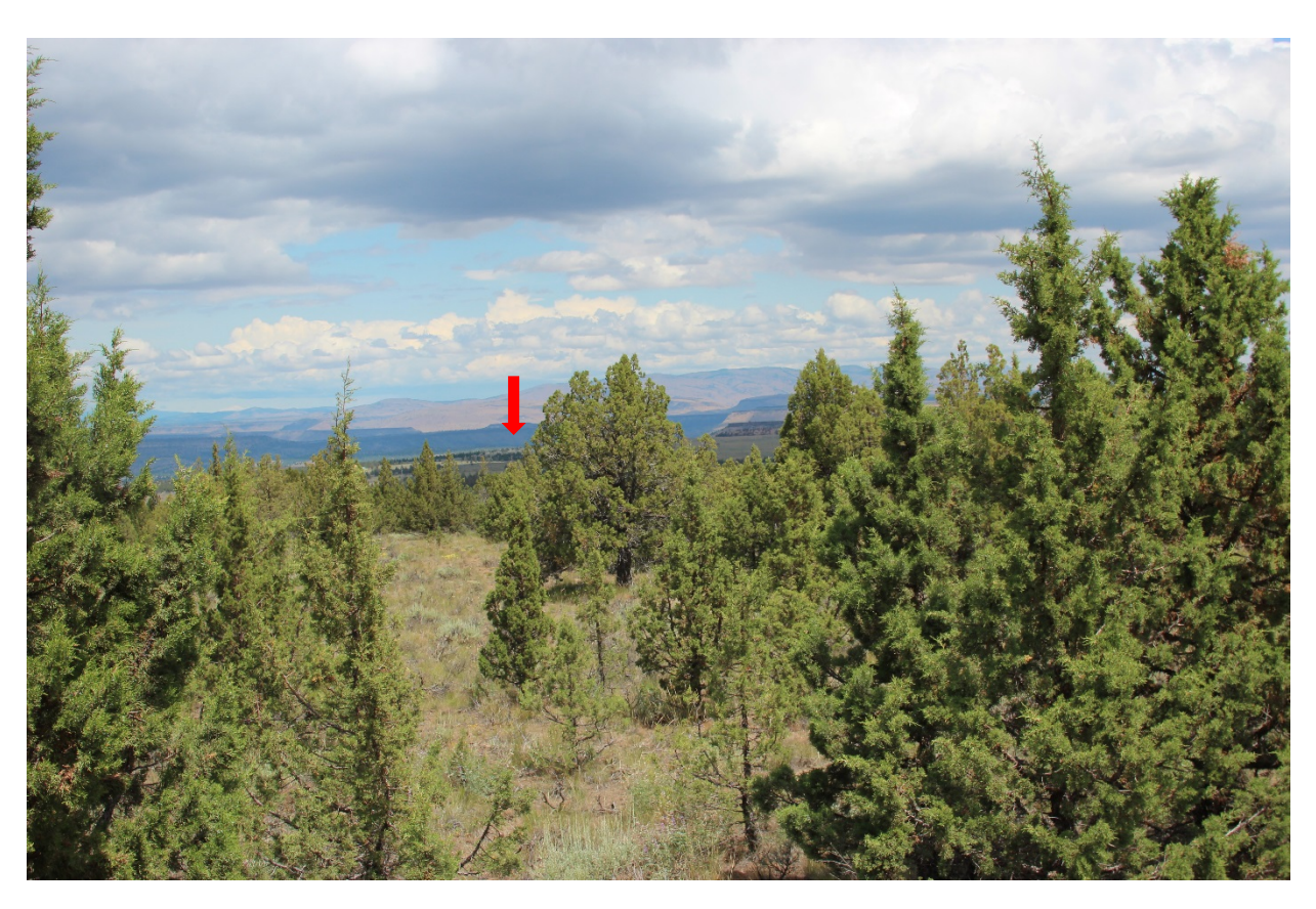
Photograph T-4 – From Photo Survey Point T-4 on Figure T-2: View from the westbound shoulder of SW Belmont Lane along the route of the Madras Mountain Views Scenic Byway heading approximately 15°N toward the Facility site boundary. (The red arrow indicates the approximate location of the Facility site about 2.5 miles north of Photo Survey Point T-4.)