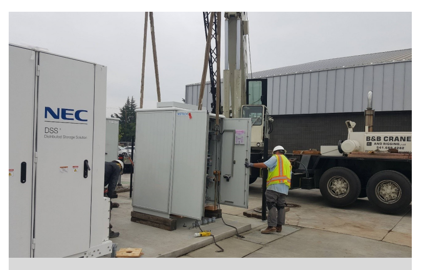
EWEB contractor installs back-up battery power system.

EWEB has partnered with the two Eugenearea school districts to install back-up power capability and install or upgrade water well equipment at district-owned facilities. Many Eugene-area schools have existing rooftop solar that could provide on-site power for pumping water in addition to the back-up power sources. EWEB is investigating several possible back-up power sources, and is installing a microgrid back-up battery power source at Howard Elementary school in 2018 and a new water well and pump station in spring 2019. This microgrid is sized to run the water well pump at the site for up to three weeks, while the existing solar array will be configured to allow for charging of the battery