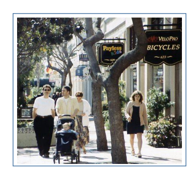
Being a pedestrian for part of every trip has multiple benefits.

Bundling the cost of parking into other items skews travel choices toward solo driving and away from transit, walking, and bicycling. Unbundled parking, where the consumer pays for the parking he or she uses, makes the cost of parking – and the savings achieved by using non-auto modes – more transparent and fair.