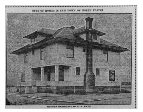
Workshop attendees liked the idea of house-like apartment structures which would fit into neighborhoods, and be compatible with North Plains historic patterns. The photo shows the Mays House, an early North Plains residence.