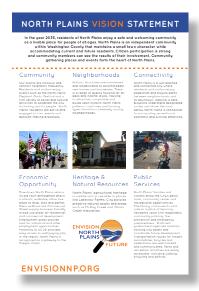
North Plains 2035 Vision

The data show that the community and the region as a whole have been growing rapidly, particularity between 2000 to 2014. Over 35% of the North Plains population moved in between 2000 and 2009, with another 31.5% moving in between 2010 and 2014. The majority of new residents have been moving into owner-occupied homes as opposed to rentals (due to the shortage of rentals). North Plains is 80% owner occupied as is Banks. Data collected for the other areas show a much lower percentage of home ownership ranging from 44-64%.