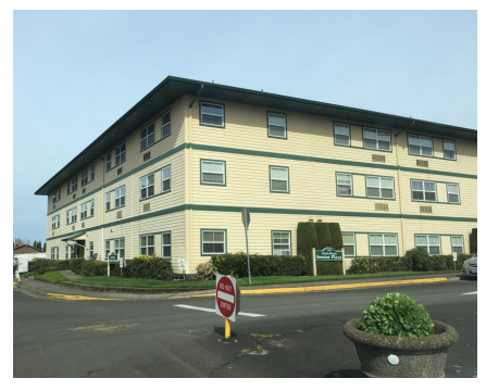
There is only one apartment development in North Plains, Senior Plaza, built in the downtown commercial zone. Notably, it is not in a residential zone.

--Donald L. Elliott, FAICP, "A Better Way to Zone: Ten Principles to Create More Livable Cities"