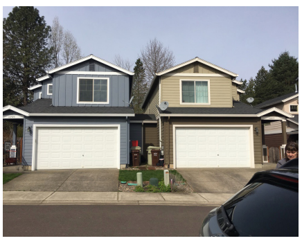
Many of the rowhouses built in the R-2.5 zone are not quite attached, due to a requirement that side yards comply with fire code separation.

Removing zoning barriers can go a long way to increase the variety of housing, increase options for renting and encourage innovation. In addition to creating more housing choices for North Plains residents, strategic removal of certain barriers can make housing less expensive to develop, which can