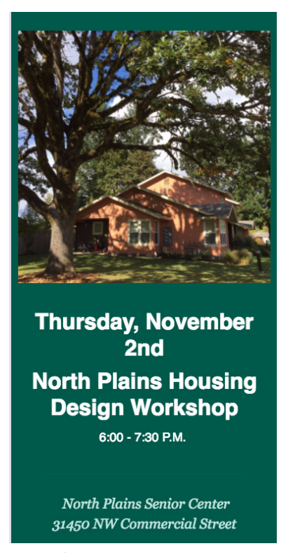
Poster for public workshop, held on Thursday, November 2nd 2017.

In 2017, the City of North Plains received Transportation Growth Management (TGM) assistance to conduct a series of small conversations leading to a public workshop, focused on housing designs for the future, designed to meet the needs of its citizens and families, including children and grandchildren, in North Plains.