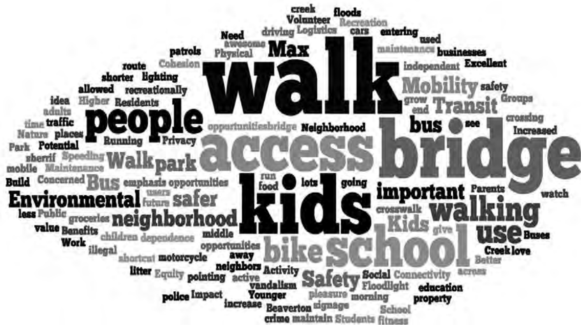
Figure 3 – Word Visualization of Community Feedback

CIO worked to inform community members of feedback opportunities through various outreach methods including door-to-door canvassing and outreach at a Beaver Acres Elementary School Parent’s Night event. One community engagement session was held at the school on June 10, 2014. Food and childcare were provided as well as language interpreters. Community members present at the meeting included parents whose children attend or will attend Beaver Acres Elementary and long time residents of the neighborhood. The community provided valuable feedback on the proposed bridge and offered insight into the opportunities and challenges of this project.