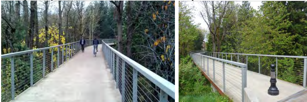
Figure 5 – Reed College pedestrian bridge

The Washington County Sheriff's Office voiced some concern over this based on experience with loitering and crime in similar settings. The recommendation is that if benches are to be utilized they should be placed at the entry points to the bridge rather than in the middle to ensure proper sight lines. It was expressed that with new construction often comes vandalism; to curb this materials should be chosen that can easily be repainted or refinished. THPRD has experience with this