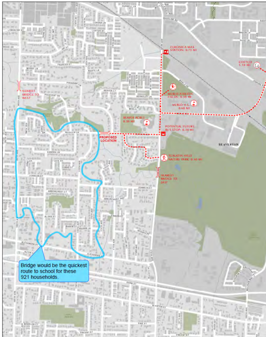
Figure 4 – Increased Neighborhood Connectivity from the proposed Augusta Lane Bridge