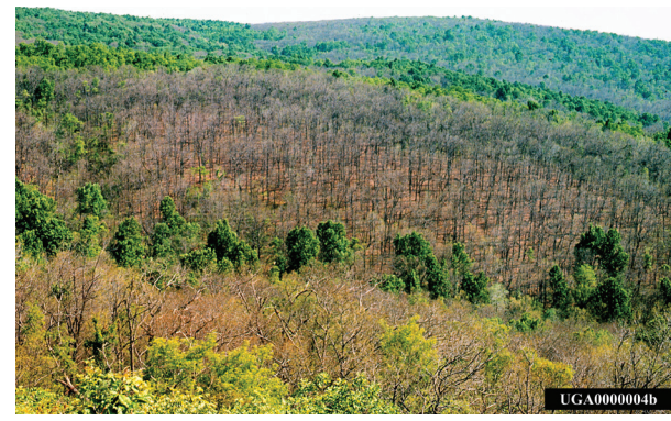
Forest defoliation from larval feeding

Gypsy moths pose significant economic, ecological, and recreational costs as populations defoliate natural and urban areas. Tree defoliation along streams can result in higher water temperatures and increased loading of organic material. As areas are defoliated, the entire habitat is affected. Fish and other aquatic organisms, as well as terrestrial plants and animals, can suffer due to the damage that they cause.