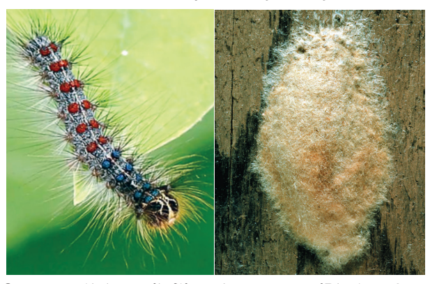
Gypsy moth larva (left) and egg mass. (Photos: Jon Yuschock, bugwood.org and USDA).

Gypsy moths produce one generation of offspring per year and lay 50-1000 eggs during the fall, depositing them in small fuzzy masses. Caterpillars hatch during the spring and begin to feed on host plants. In early July, the caterpillars transform into a non-feeding stage called the pupa and begin to develop into a moth. By mid- to late-July adult moths emerge, mate, and the life cycle begins again.