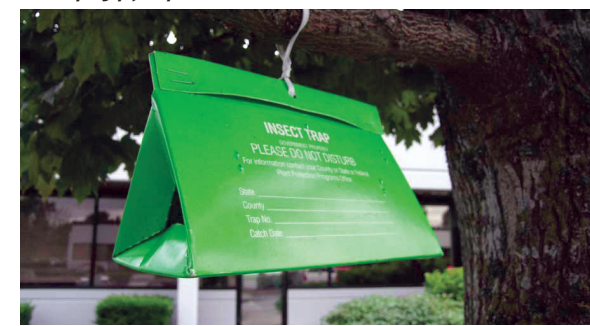
Oregon uses the delta trap to detect European and Asian gypsy moths.

The Oregon Department of Agriculture (ODA) and affiliated organizations have successfully protected Oregon's natural and agricultural areas from biological invaders, such as gypsy moth, for approximately 40 years. The success of these projects has largely been attributed to applying the Early Detection Rapid Response (EDRR) protocol for invasive species, which places a high priority on preventing introduction and establishment of any gypsy moths.