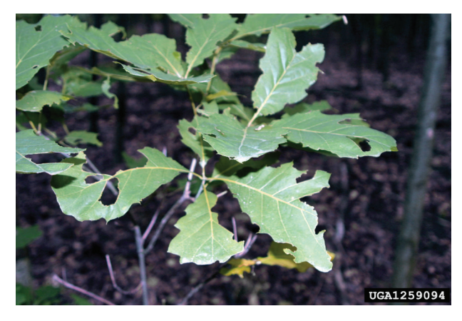
Larval feeding damage on oak leaves.