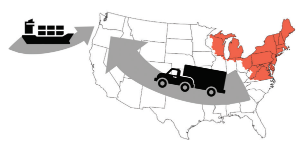
Invasive insects have many pathways into Oregon. The red area shows the range of gypsy moth in the US.

European gypsy moths mainly enter Oregon on infested items brought from eastern areas of the country where gypsy moth populations are established. The female lays her eggs on solid surfaces, such as outdoor furniture, recreational and other vehicles, firewood, birdhouses, and doghouses. As people travel from the eastern states, they often bring these contaminated items with them, allowing the moth to hatch and spread.