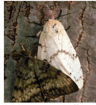
Adult gypsy moths.

The gypsy moth is an exotic, highly destructive invasive species that has defoliated millions of acres of trees and shrubs in the northeastern United States. It is established in 19 states in the