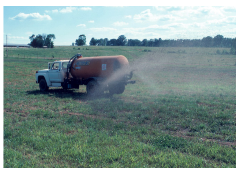
Apply crop nutrients in such a way that they do not enter streams.

Applying nutrients at an agronomic rate ensures that plants receive needed nutrients for growth and makes plants more competitive