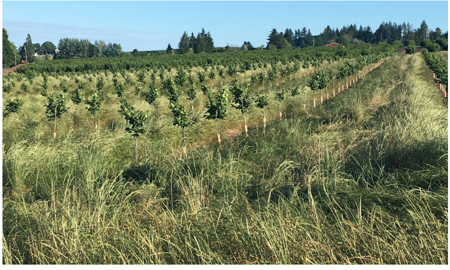
Grass between orchard rows helps prevent leaching and runoff of fertilizers.