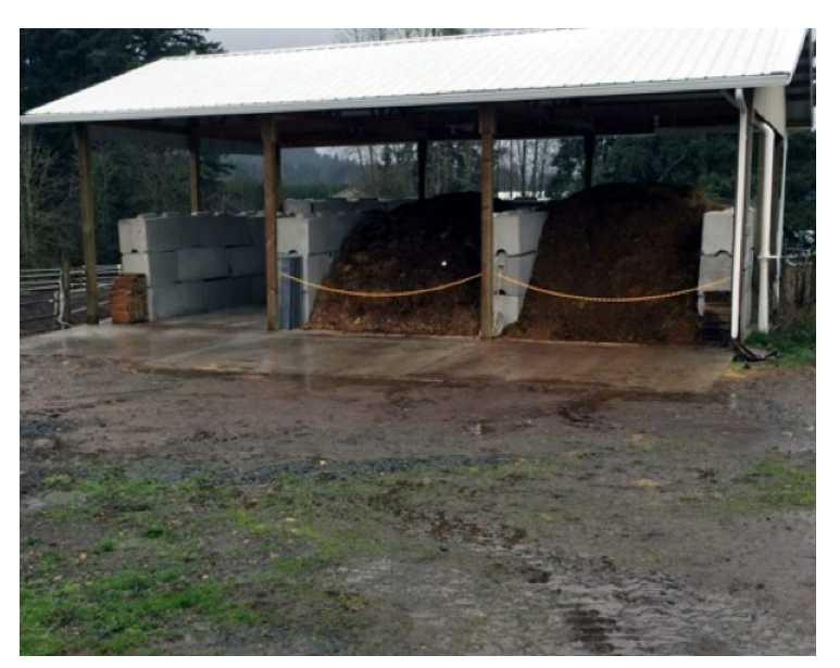
Manure is stored on a concrete pad under cover.