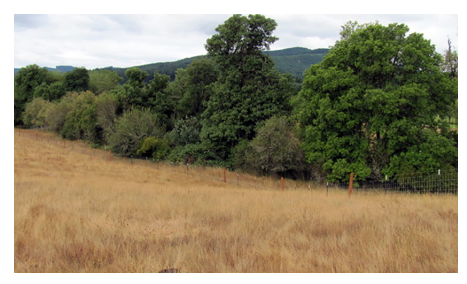
Fence livestock away from streams.