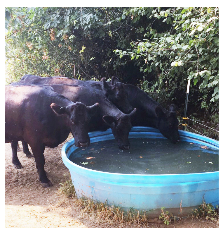
Water is held in a tank as a drinking-water source for livestock.