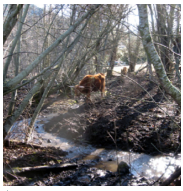
Fences are needed to keep animals from waterways.

Agricultural Water Quality Management Area Plans (Area Plans) address agricultural water quality issues in Oregon. As the LACs helped create the Area Plans, they also helped write Area Rules (regulations) for that Management Area. The Area Rules ensure that all landowners do their part to prevent and control water pollution. The Program is designed to help anyone engaged in agricultural activities prevent water pollution.