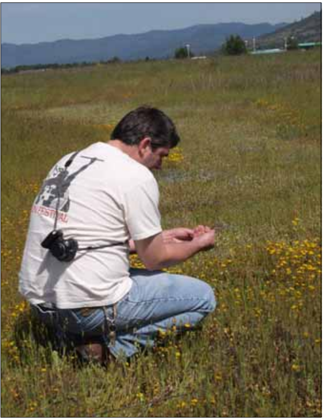
Figure 2. Collecting Limnanthes seed in the Rogue Valley, Jackson Co., Oregon.

(covered through OR-EP-2, Seg. 21) focused on seed bulking , i.e., growing large numbers of plants under cultivation for seed harvest, in this case following the protocols discussed in McGonigle (2011). This was identified in the Section 6 project statement accompanying the FY2011 federal assistance agreement as the primary objective of the Seg. 21 work. The use of bulked seed to establish new populations of rare or endangered species, or