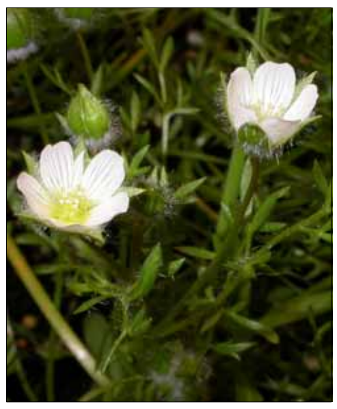
Figure 1. Flowers of Limnanthes floccosa ssp. grandiflora.

Seeds of this extremely local endemic germinate in late winter to early spring under submerged conditions (Meyers, pers. comm.), plants grow and bloom in April,