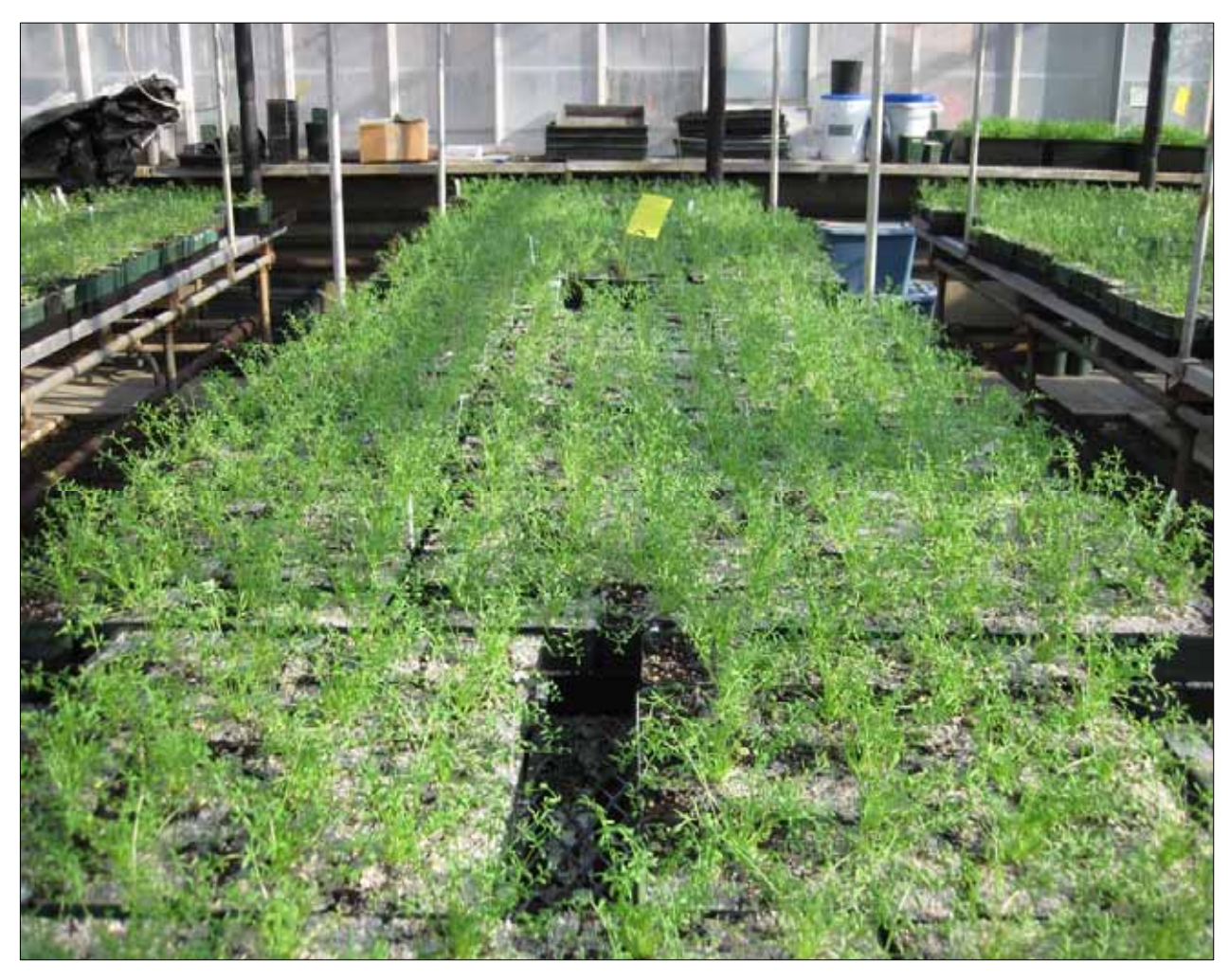
Figure 3. Limnanthes floccosa ssp. grandiflora plants being grown for seed bulking in OSU greenhouse in Corvallis (September 11, 2011).

seeds); Jackson Co. School (24,852 seeds); and Agate Desert Preserve (29,280 seeds). Seeds have been processed and are in dry storage at OSU. Output data for the 1,624 plants included an estimated total of 33,118 fruiting calyces (Fig. 4) for the growout, or about 20.4 flowers per plant (data for all populations lumped). This contrasts with the roughly 23 to 31 flowers per plant (pooled average = 27.7) observed during the more limited 2010 cultivation work (McGonigle 2011). Reasons for the reduction in flower number during the seed bulking work are not entirely clear, as the greenhouse protocols for both years are believed to have been very similar. The primary difference was time of year, with the 2010 plants germinated in early June and grown through late August (flowering largely in July), while the 2011 plants were grown from early August through October or so (with most of these flowering in September).