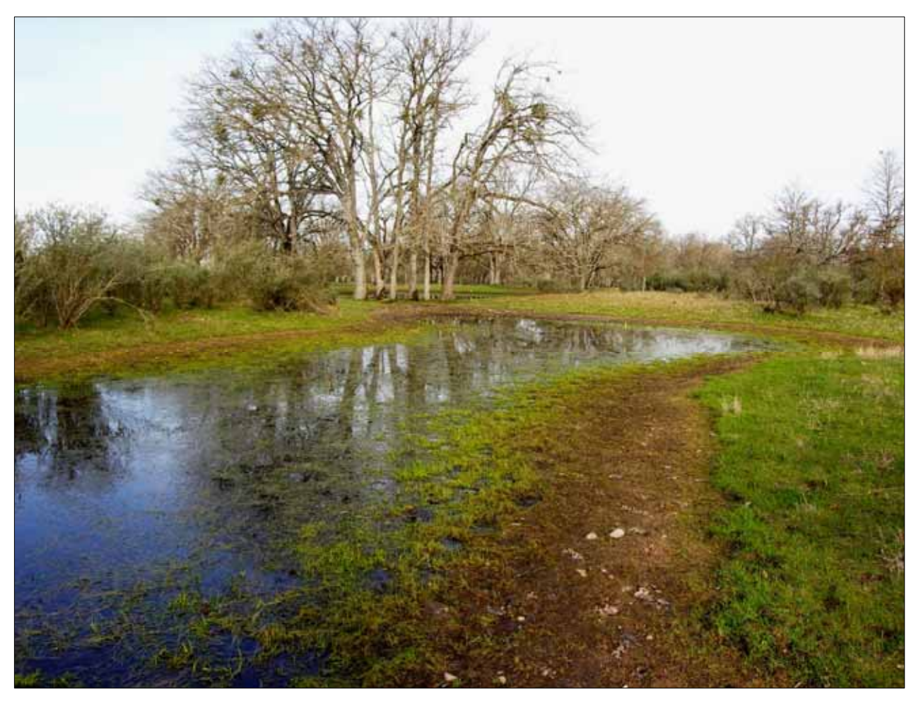
Figure 6. An example of a potential site for Limnanthes re-introduction work at ODOT's Whetstone Vernal Pool Mitigation-Conservation Bank in Jackson Co., Oregon.

Finally, due to the time elapsed, we have decided to go ahead and use the fresher seed grown during the 2011 seed bulking work for the joint mitigation/re-introduction project at the Whetstone Vernal Pool Mitigation-Conservation Bank (Fig. 6), as opposed to stored seed from 2008. To offset the take of 87 meadowfoam plants, PacifiCorp and ODA originally determined that a 350 plant minimum population would need to be created (or added as augmentation to an existing population). This figure was based on past work by TNC at one of their preserves, in