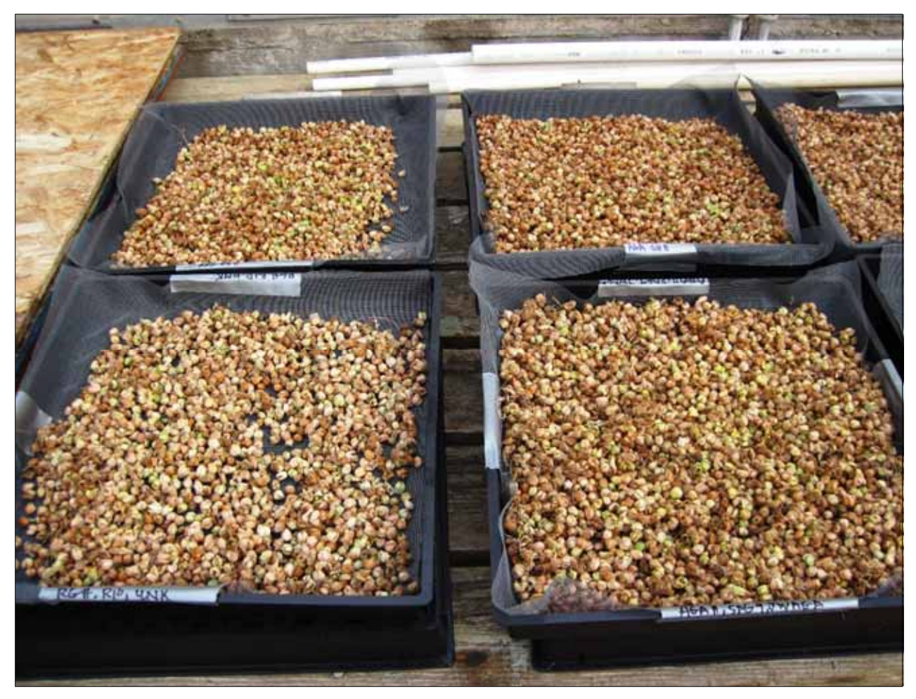
Figure 4. Dried calyces (with seeds) from Limnanthes floccosa ssp. grandiflora plants grown for seed bulking (December 5, 2011). Seeds are in storage at OSU.

photoperiod decline. By mid-July, 2010, climate records show that day length would have been around 15 hours and 10 minutes in Corvallis, while in mid-September, 2011, the time from sunrise to sunset was roughly 12 hours and 30 minutes (a difference of 2 hours and 40 minutes).