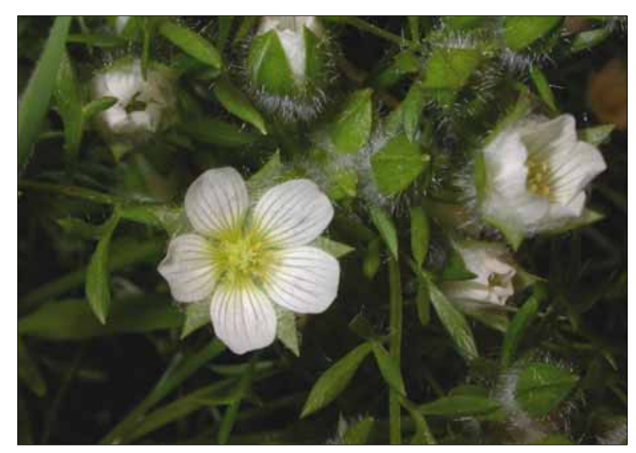
Figure 5. Flowers of Limnanthes floccosa ssp. grandiflora are more apt to be pollinated by insects than other selfing subspecies of L. floccosa , since flowers are larger and the corolla has an open phase more conducive to occasional cross-pollination.

However, temporally-related decreases in flower size in relation to resource availability (including photoperiod) are well-known, and have been shown in many plants to improve seed yield through increased autogamy (Cruden 1973). Brock et al. (2009) demonstrated, in the short-lived annual Arabidopsis thaliana , that seasonal abiotic variation can influence floral morphology, and that photoperiod was correlated with the length of petals, stamens, and pistils, which changed in relative size for flowers growing in waning day lengths. Meinke (unpublished) has observed this in the greenhouse for several annual, selfing species of Mimulus as well. A reduction in flower size over time can lessen the degree of physical separation (known as herkogamy ) between male and female reproductive parts in flowers, which in self-pollinating plants, such as Arabidopsis (or Limnanthes ), can improve the efficacy of autogamous seed production.