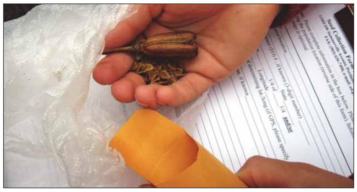
Figure 3. Mesh bags affixed around developing seed capsules ensured no seed was lost as the capsules matured and dehisced before collection.

<sup>b</sup> estimated seed yield based on capsule to seed ratio in the 2009 accession