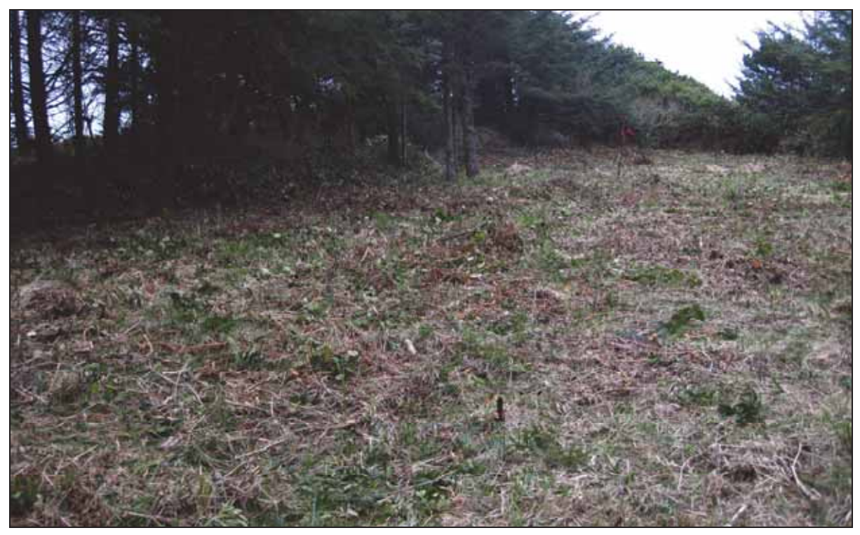
Figure 7. At Shore Acres State Park, the northern sinkhole site was manually cleared of vegetation down to ground level.