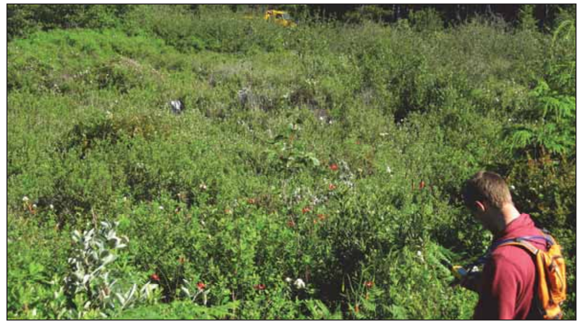
Figure 4. Prior to habitat enhancement at Hauser Bog, western lilies (visible in the foreground) were growing amongst dense vegetation.

(slough sedge) stands was avoided due to previous poor outplanting results in this type of habitat in California (Imper, USFWS, Arcata, California, personal communication).