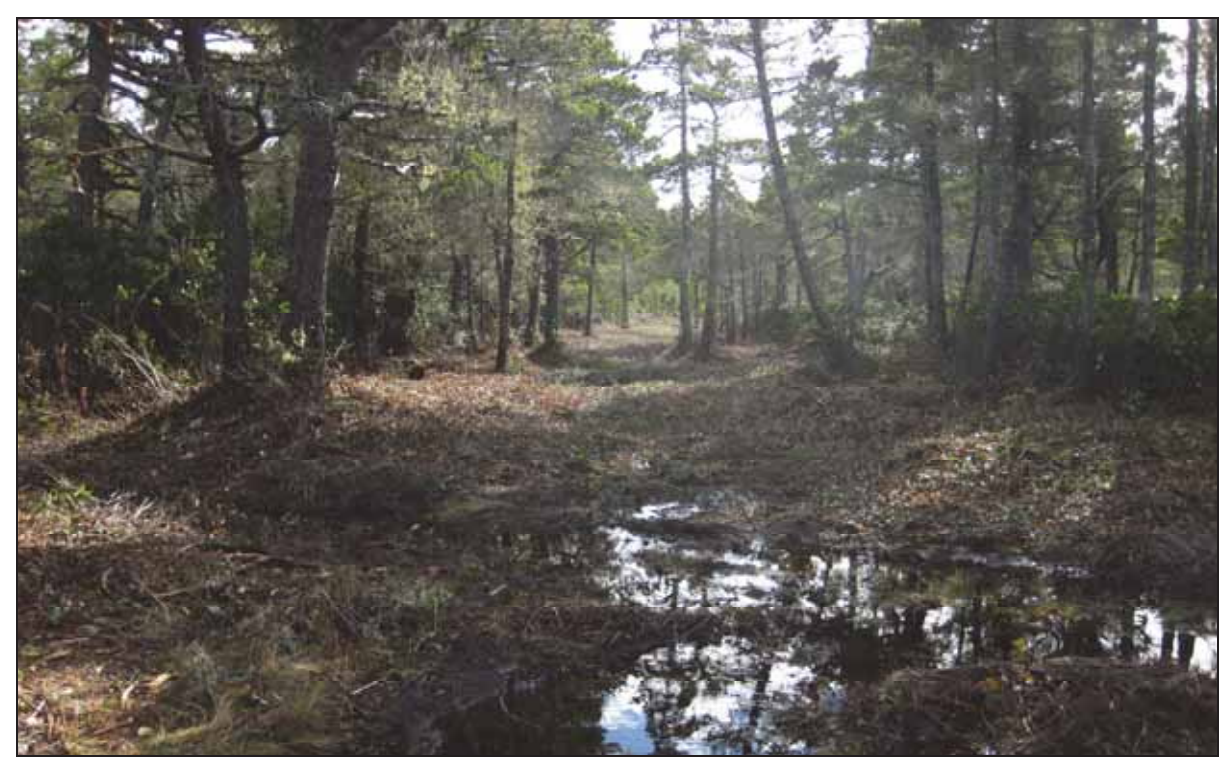
Figure 8. Mowing was used to enhance western lily habitat along the trails at Floras Lake State Park.