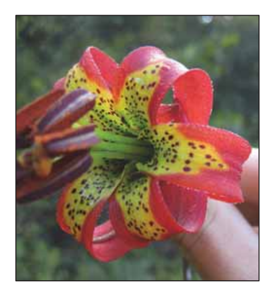
Figure 1. The particularly showy flower of Lilium occidentale ; note the distinctive diagnostic green center.

With spectacular crimson and golden flowers, the western lily ( Lilium occidentale , Liliaceae) is one of the most stunning rare plants in our region (Figure 1). Unfortunately, its beauty may be underappreciated, as the species is declining and rarely seen across most of its limited range, from just south of Humboldt Bay in California to the vicinity of Coos Bay in Oregon. Along this approximately 200 mile (320 km) stretch of Pacific coastline, L. occidentale occurs only as far as four miles (six km) inland (USFWS 1998). Within this narrow distribution, the species is restricted to freshwater fens, bog edges, and seasonally wet areas where it grows in coastal prairie and scrub.