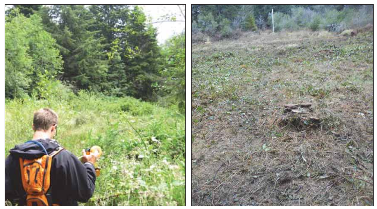
Figure 9. The Highway site at Harris Beach State Park was overgrown (at left) prior to vegetation removal that took place during the winter of 2011 (at right).