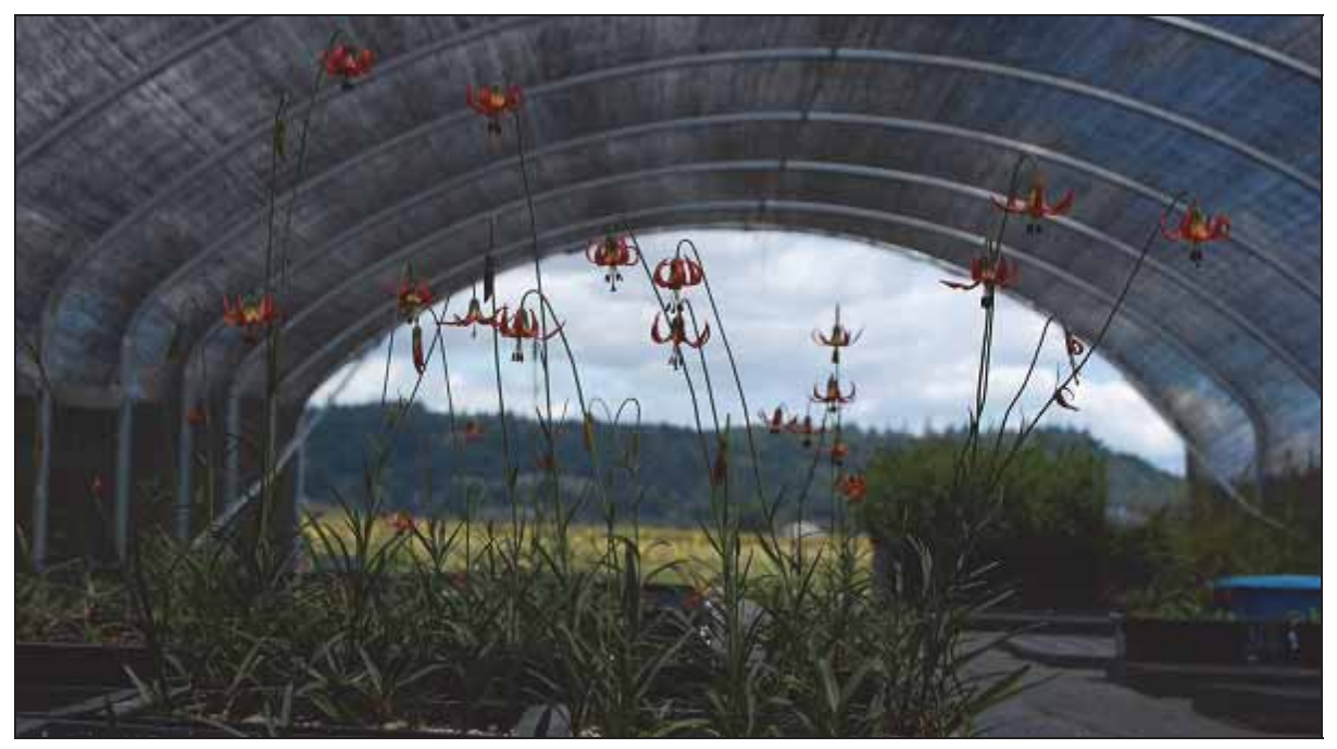
Figure 12. With assistance and consultation from ODA, NRCS met production goals for western lily transplant cultivation in 2011.