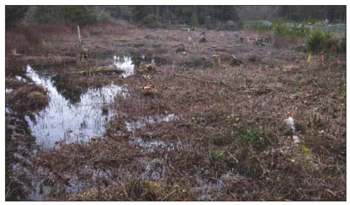
Figure 5. Vegetation at Hauser Bog was removed from the main bog area (shown here) and adjacent southern pond area to enhance habitat for existing western lilies while improving conditions for the upcoming outplanting.