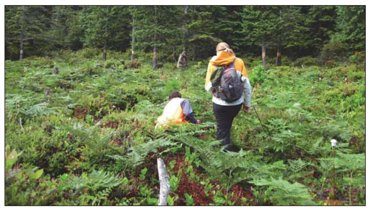
Figure 6. At Bastendorff Bog, large conifers growing in previously cleared habitat were girdled (as shown in the background) and dense brush was removed.

Some planting areas were demarcated in currently unoccupied habitat adjacent to known occurrences. OPRD plans to monitor the response of existing L. occidentale populations to the habitat treatments, expecting to see an increase in plant size and number in currently occupied areas, and possibly in historically occupied areas as well. Keeping the transplants separated from extant populations, even by a short distance, will reduce interference between the two groups and prevent confusion during monitoring. Final planting area selections will be made from preselected areas once the cultivated bulb yield is determined.