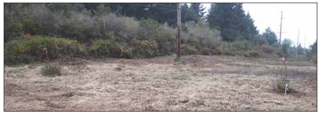
Figure 10. The Powerline site at Harris Beach State Park was eventually mowed during the late fall of 2013.