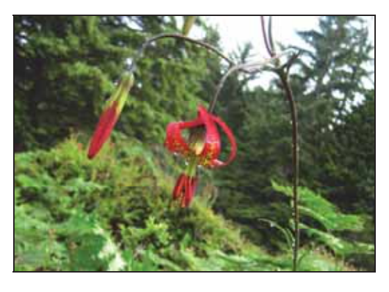
Figure 13. Western lily is a beautiful representative of the unique wetlands where it resides.

In accordance with the recovery priority number (2) assigned to Lilium occidentale , the USFWS stated that "the taxon is a species that faces a high degree of threat, and has a high potential for recovery" (USFWS 2009). The upcoming reintroductions are possible because healthy L. occidentale populations exist and can provide propagules. That might not be the case if it were not for past and current conservation efforts, and our goal is to continue these efforts. The western lily is an eye-catching representative (Figure 13) of the unique habitats it shares with other peculiar plants, such the carnivorous California pitcherplant ( Darlingtonia californica ) and roundleaf sundew ( Drosera rotundifolia ). These habitats, along with the western lily, are under pressure. Although on-site conservation via reintroductions and augmentations will help secure the future of the western lily, there are still many fundamental questions regarding the natural history and maintenance of these populations that need to be answered. As for right now, current cultivation and upcoming reintroduction efforts, supported by a wealth of preexisting data from previous L. occidentale research, increase the potential for a timely recovery of western lily.