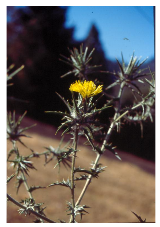
Distaff thistle flower, photo by Ken French, ODA

Findings of This Review and Assessment: Distaff thistles, Carthanus lanatus, C. baeticus , were evaluated and determined to be category <u>"A"</u> rated noxious weeds, as defined by the Oregon Department of Agriculture (ODA) Noxious Weed Policy and Classification System. This determination was based on a literature review and analysis using two ODA evaluation forms. Using the Noxious Qualitative Weed Risk Assessment v.3.8, distaff thistles scored <u>69</u> indicating a Risk Category of <u>A</u>; and a score of <u>18</u> with the Noxious Weed Rating System v.3.2, indicating a <u>"A"</u> rating.