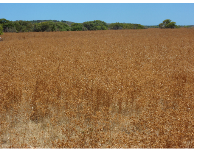
Distaff thistle infestation in Australia, photo by Dennis Isaacson, ODA