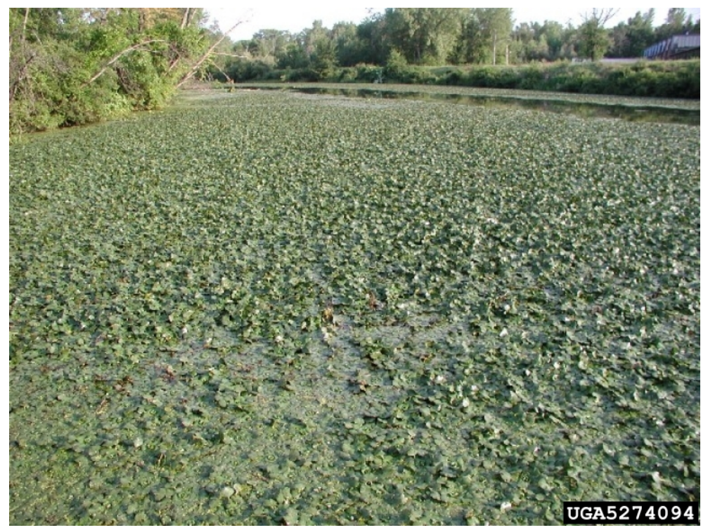
European water chestnut infestation

Environmental Impacts: European water chestnut has become a significant nuisance aquatic weed in the northeastern United States, especially in the Hudson and Potomac Rivers, Lake Champlain and in the Connecticut River Valley. Due to its dense, clonal, mat-forming growths the species impedes navigation; its low food value for wildlife potentially can have a substantial impact on the use of the area by native species. The dense surface mats, like those produced by European frog-bit ( Hydrocharis morsus-ranae ) in southeastern Ontario, likely also reduce aquatic plant growth of other species beneath the shade of the floating canopy. Light extinction under Trapa canopies can reach 100% (Hummel and Finley 2006). The abundant detritus in the fall of each year and its decomposition could contribute towards lower oxygen levels in shallow waters and impact other aquatic organisms. The sharp spiny fruits can also be hazardous to bathers. Research on fish populations within large Trapa beds is extensive and documents steep declines in fish populations (Hummel and Finley 2006). Impacts on dissolved oxygen, nitrogen have been researched and found to be altered in the largest beds (Hummel and Finley 2006). Macro invertebrate fauna has also be researched in the Hudson River under large mats of Trapa and found not to be effected (Kornijow 2010).