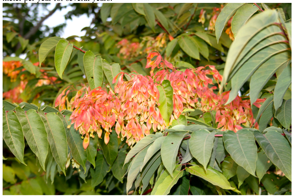
Maturing seed heads

Tree of heaven produces an abundance of winged seeds born on dense clusters. Flowering begins in June with seed maturity occurring in September-October. Seeds will remain on the trees throughout the winter and can be dispersed well away from the parent trees by winter storms. On the east coast, seeds establish rapidly forming a deep taproot and in compacted soils they put forth long lateral roots. Root fragments separated from the mother plant send forth shoots forming new trees. Mechanical disturbance can increase tree densities by chopping roots up into many fragments. In California, despite high seed production, very few seedlings are observed. Most reproduction and spread result from lateral root growth sometimes extending 50 feet from the mother plant. This growth produces clonal thickets of up to an acre. Vertical growth is also rapid with emerged shoots often growing a meter per year for several years.