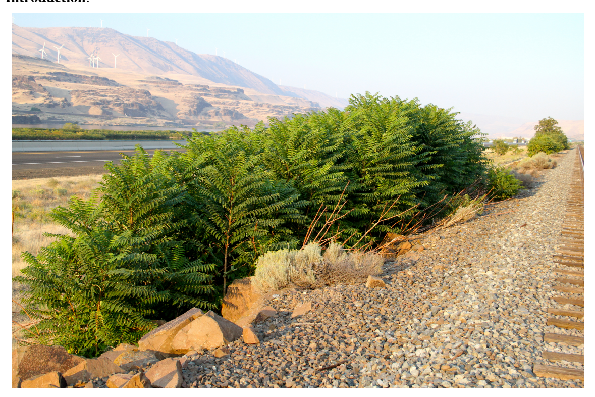
Stands of tree of heaven by the railroad tracks in Rufus, Oregon

Tree of heaven is an aggressive, highly persistent tree species known to infest both urban and rural areas of the East, Midwest and Western states. Originally planted as an ornamental tree as far back as 1784 it became readily available in nurseries by the 1840's. Tree of heaven is a survivor. It thrives in the toughest of city conditions tolerating dry soils, heavy air pollution, dust, and poor soils. It frequently grows through sidewalks, parking lots and streets, pushing up through pavement making control difficult. Away from cities it is commonly found in fencerows, woodland edges and forest openings. In Oregon it is highly naturalized along the Columbia River from Hood River County to Umatilla County growing in low moisture and high wind conditions.