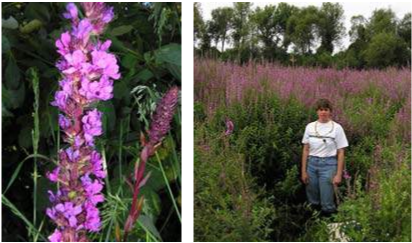
Purple loosestrife flower (L) and infestation at Horseshoe Lake, Marion County (R).

Purple loosestrife is a semi-woody herbaceous plant with long showy spikes made of showy purple flowers consisting of 5-6 petals. The seeds are very small, and large plants can produce over one million seeds. Stems are four to six sided and leaves are lance-shaped with smooth margins. Plants can be 3-10 feet tall, and have a single flowering spike or many, depending on age and habitat.