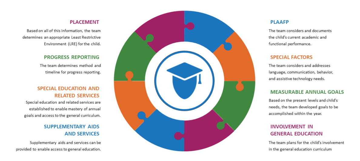
Figure 1: Flowchart for Implementing LRE when Developing an IEP or IFSP

Reference: Optimizing Outcomes for Students Who Are Deaf or Hard of Hearing, 3<sup>rd</sup> edition.