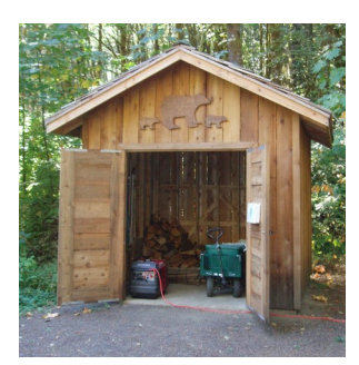
Most campgrounds have a woodshed similar to this one at Gales Creek for storage of firewood and host supplies.