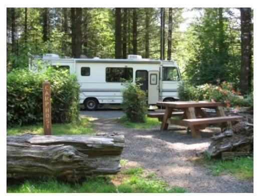
Jones Creek Campground has two camp host sites. Both are spacious and enjoy a lovely setting of large trees and lush understory vegetation.