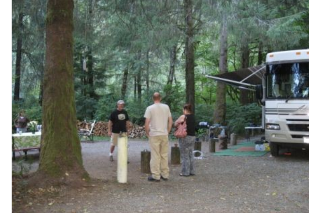
The Nehalem Falls Host Site is nestled in a forest setting.