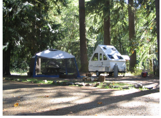
Campsites at Spruce Run are set among large trees or are adjacent to the Nehalem River.