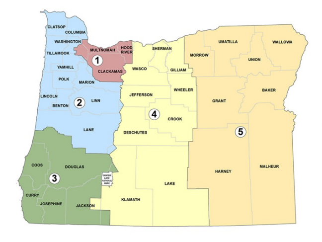
Region 1: Portland Metro

ODOT divides its operations into five geographical regions. Each region is responsible for developing and managing transportation construction projects and maintaining state, federal, and interstate highways and other transportation infrastructure within its boundaries. This map depicts the boundaries of the five ODOT regions: