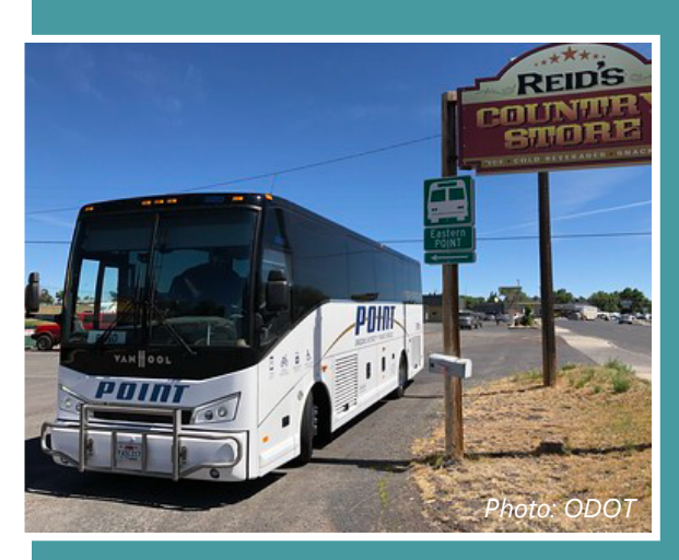
Rural transit works to connect people and communities to key destinations.