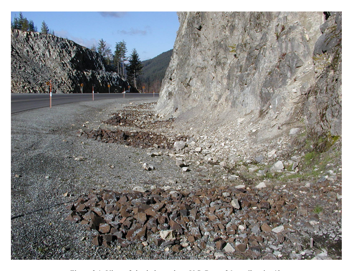
Figure 3.1: View of check dams along U.S. Route 26 at milepoint 49.