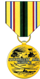
SOUTHWEST ASIA SERVICE