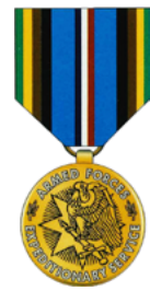
ARMED FORCES EXPEDITIONARY