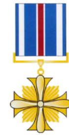
DISTINGUISHED FLYING CROSS