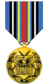
GLOBAL WAR ON TERRORISM EXPEDITIONARY