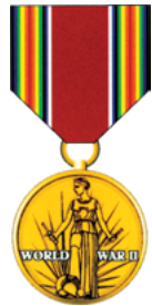
WORLD WAR II VICTORY