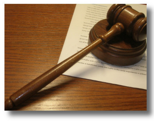
gavel.jpg – My Trusty Gavel