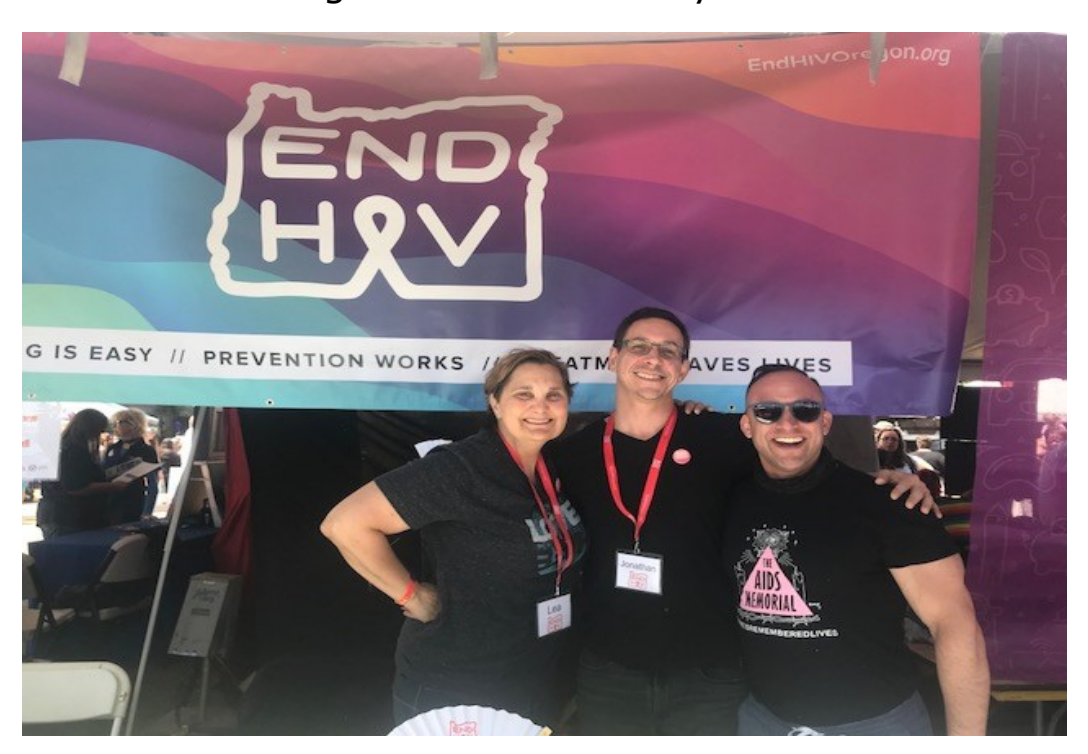
Cascade AIDS Project Staff and families