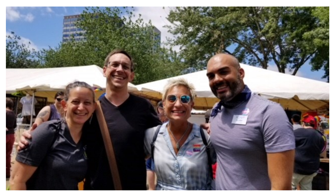
Leadership of OHSUs Partnership Project, Cascade AIDS Project, Our House and CAREAssist