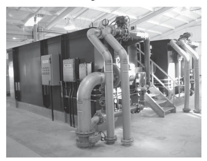
The $3 million project was financed from existing district funds, a $1 million bond and $1.7 million in Drinking Water State Revolving Loan funds.

In April, after 37 years as an unfiltered surface water system, the Heceta Water District in Florence completed construction and began operating a 1.2 MGD (million gallons per day) conventional package water treatment plant. The district, which serves approximately 2000 customers, was ordered to install filtration under the Surface Water Treatment Rule (SWTR) in January of 1992. Negotiations with nearby landowners and Lane County as well as litigation in federal court delayed the construction project for many years. Finally, agreements were reached with all parties concerned and construction began in 2002. The construction project consisted of a new raw water transmission line from Clear Lake to the treatment plant, two 0.6 MGD conventional package treatment units, treatment plant building, 0.2 MGD chlorine contact chamber and backwash lagoon.