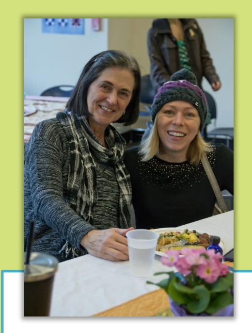
They look happy, don't they?