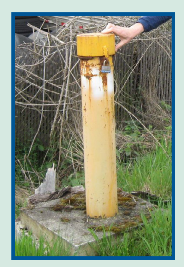
Monitoring well head

Flare: A structure that contains the landfill flare, the blower and the compressor, is located on a securely fenced-in cement pad near Northeast 75th Avenue and Killingsworth Street. The flare is used to burn off methane gas when it reaches a certain level. Currently the system operates for about two hours each day and is monitored regularly by Metro. Use of the methane gas as a source of energy to power some of the proposed park features was considered. However, the landfill does not produce enough gas to make the investment in infrastructure worth the effort to harness the energy produced.