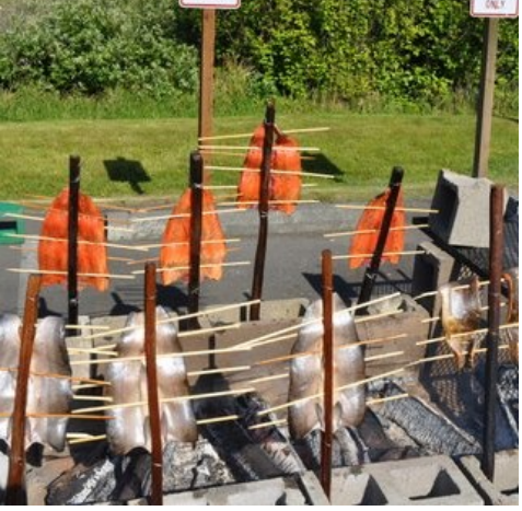
Traditional salmon bake

This was the 10th annual Tribal Public Health Emergency Preparedness conference hosted by the Northwest Portland Area Indian Health Board and it was a huge success. Feedback received thus far is this year's agenda was the best yet, it was very difficult to decide which session to attend, and the tribes want more than an hour in the individual state breakout sessions (Idaho, Oregon, Washington) for open discussion. However, attendees really appreciated all three states coming together after the individual sessions to share what was discussed as a group. Three days of intense networking and learning from partners highlights all of the incredible work and synergy happening among the tribes and partners in the Pacific Northwest.