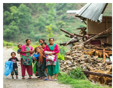
A family beside a damaged house near Naglebhare, Nepal.

Research in behavioral science has shown that hearing other people's stories can be an important component of engendering change. To that end, I wanted to share my story related to Nepal and earthquake preparation.