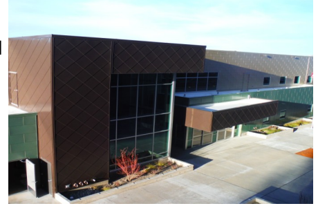
Jackson County's new Health & Human Services Building

Jackson County HHS uses a way-finding system to help clients and the public find their way in the new building. Each area of service is color coded and has a symbol associated with it. For example, the Public Health Clinic check-in area is green with a symbol of a tree; the WIC check-in area is red and the symbol is an apple. All signage has also been translated into Spanish.