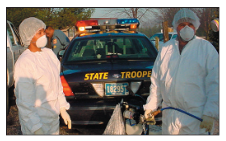
Coordination between public health and law enforcement during all types of emergencies is the topic of a national workgroup.