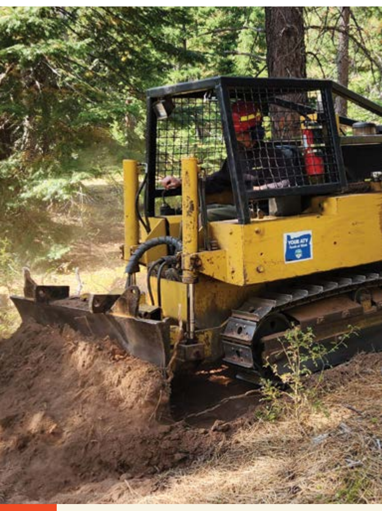
Trail dozer building a new OHV trail.