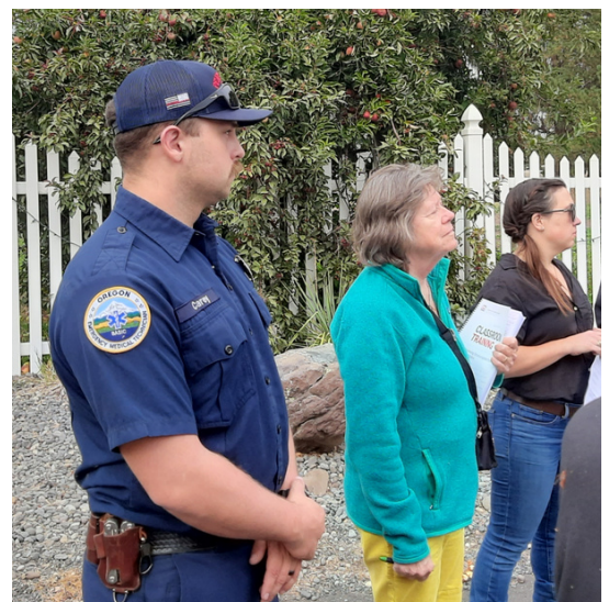
Attendees practice lessons learned at the Hermiston ASIP course.