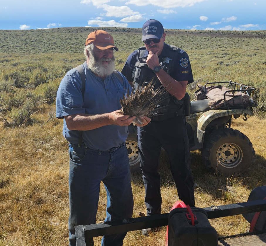
A successful hunter shows off the tail feathers of a legally harvested male sage grouse to a Fish and Wildlife Sergeant in the Trout Creek Mountains.

A Fish and Wildlife Sergeant and Trooper from The Dalles patrolled the Whitehorse Unit for five days in early September. Many antelope hunters, Trout Creek Traditional Archery hunters, and sage grouse hunters were checked throughout the week. Some minor license violations were addressed.