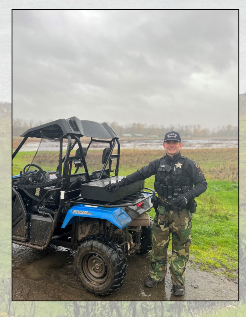
On the cover: A Fish and Wildlife Trooper on patrol in the Sauvie Island Wildlife Area