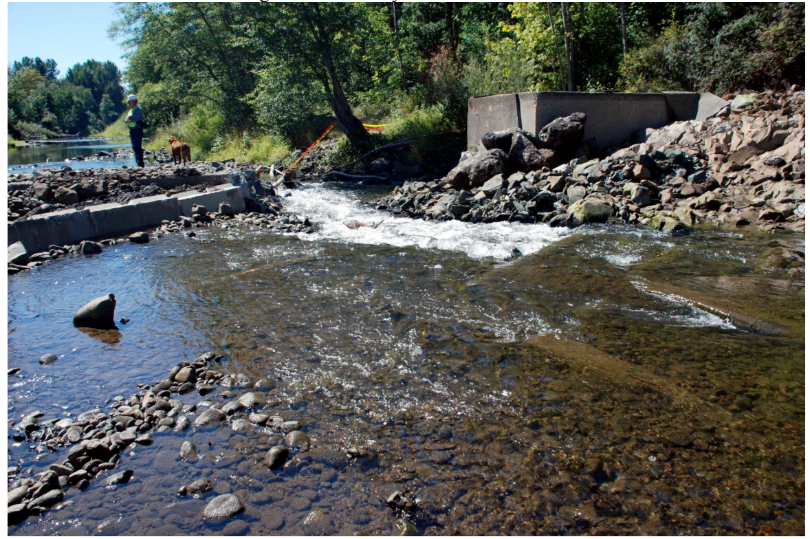
Brownsville Dam August 28, 2007 Day 2 of construction (Looking downstream) Wooden crib dam visible after notch on North side removed and sediment washes out from on top of these old logs. Structure has rebar bolting it down, so likely it is remnants from the 1940s cribdam.

Brownsville Dam – August 18, 2007 Community members remove the flashboards for the final time. The flashboards raised the height of the dam by 5 feet to divert flow into the Brownsville Canal.