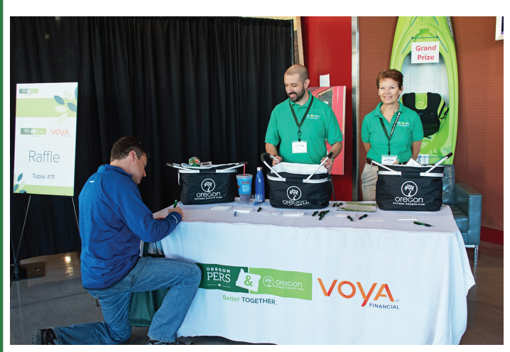
One lucky public employee won an Oregon Savings Growth Plan-branded kayak at the Expo raffle.

"After the Expo, I realize there is so much more I need to know before I consider retiring." - PERS member