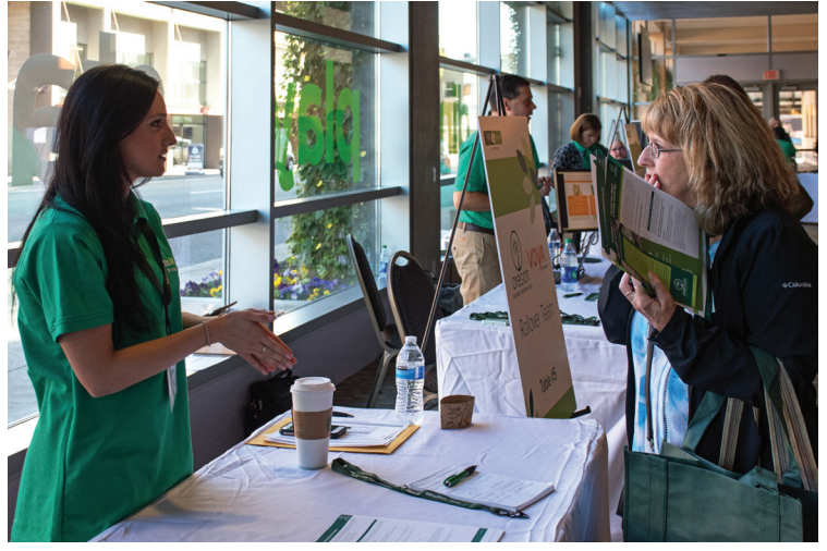
Expo staff spent the day answering questions and helping members understand their future retirement benefits.

On Thursday, October 11, thousands of public employees filled the Salem Convention Center for PERS/OSGP Expo '18: Explore Your Financial Future.