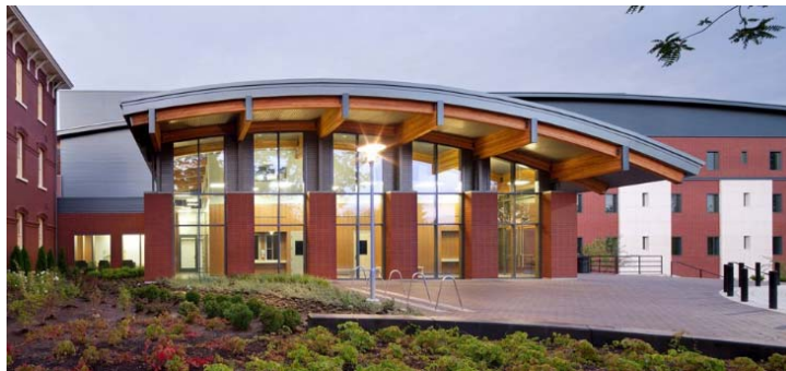
Kirkbride Building ↗

Be sure to bring your ID and inform the folks at the desk that you are here for a PSRB hearing. They will screen you in the lobby and someone from security will bring you back to the hearings room. Please note that OSH is a secure facility and thus there may be certain items you are unable to bring in to the hearings room. However, OSH does provide lockers for safekeeping in the event you have an item that cannot be brought into the hearing room. Depending on the docket day and where we are in the schedule, security may take you directly into the hearings room or take you to a conference room to await the hearing.