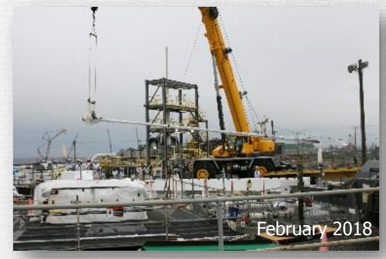
Pump removal from AX-102