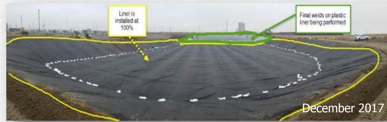
SX Farm Interim Barrier